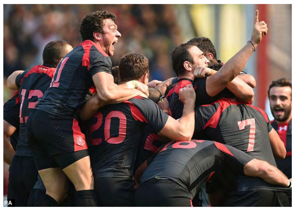
thank them for so much heroism longer a sport, it is an expression very proud of this day," said the and devotion. This alone is no of the national spirit, and I am Prime Minister.

"It was a truly heroic sacrifice, which is a great success. I want to congratulate all of our citizens, athletes, coaches, and I want to