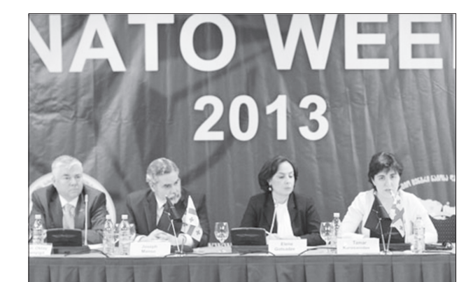
attaches of NAIC

shoulder with U.S. Marines and Afghan government forces in Afghanistan - as equals, friends and brothers. This is a fight for the values we share," said Nor-