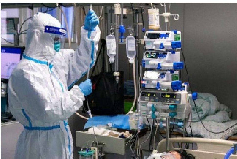
There are more than 590 cases reported in Georgia.

The virus has originally spread from the Wuhan region of china, where it has infected more than 80,000 people. The virus quickly spread around the world and as of now its cases have been reported in most of the countries around the world.