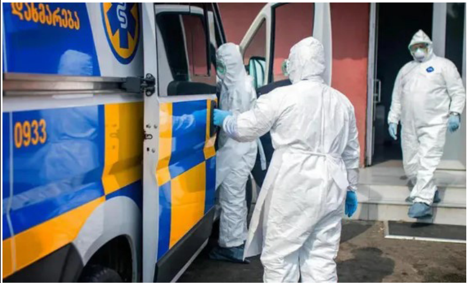
The cases of the virus in different regions of Georgia are rising.