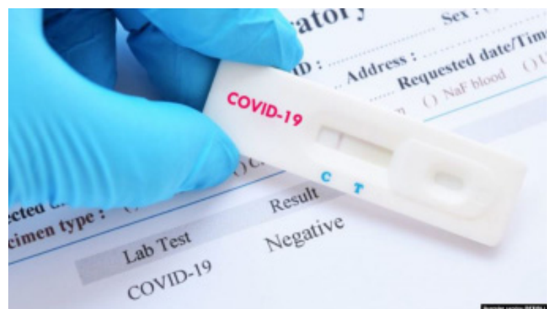
An investigation is underway under Article 187 of the Criminal Code of Georgia

The number of people infected is rising every day. In Georgia, there have already been more than 590 cases reported, out of which, 9 have died and 221 have recovered.