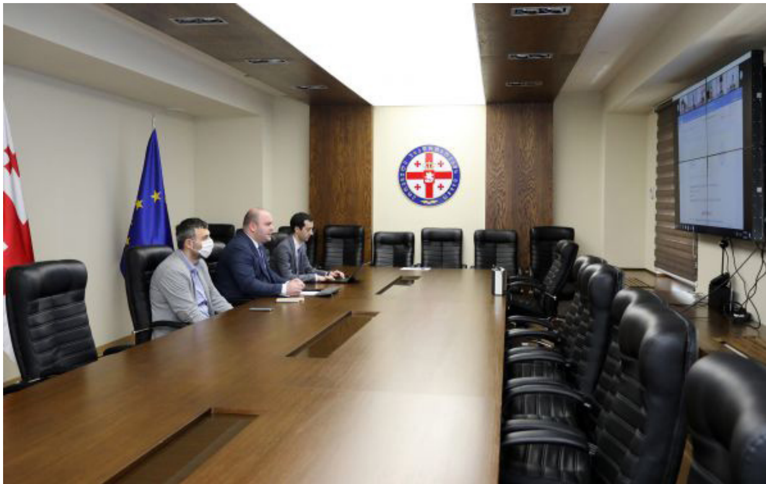
Parties discussed future plans of the government