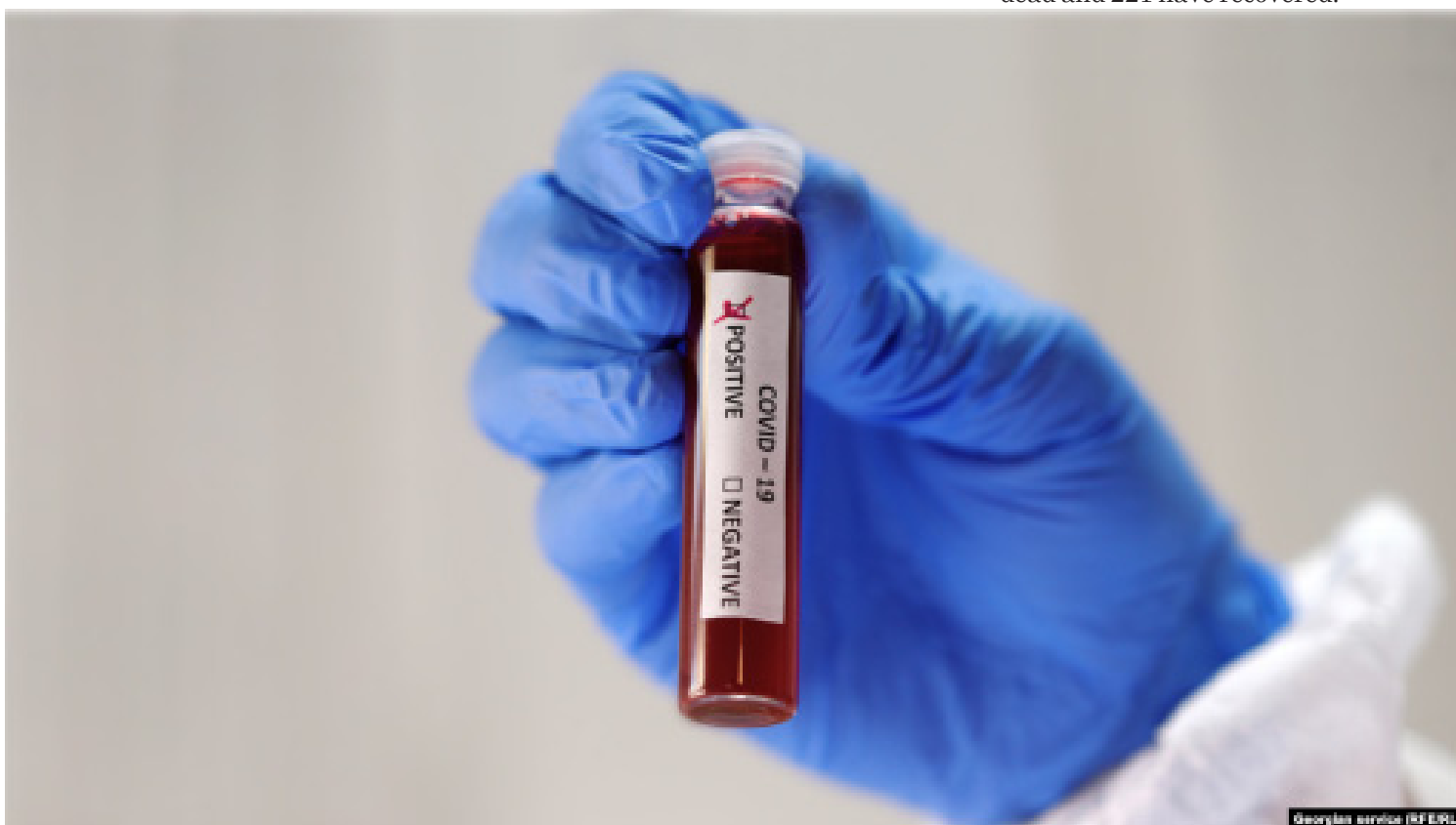
The first case of the coronavirus was reported in Georgia two month ago

The following issues were covered: further activities of the post-crisis tourism support plan; promoting the construction and infrastructure industry and major firms; implementing strategy to encourage foreign direct investment and improv-