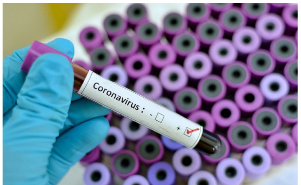
The virus has originally spread from Wuhan region of China.