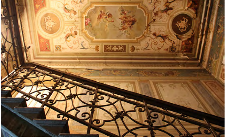
Home Ananova. Tbilisi.