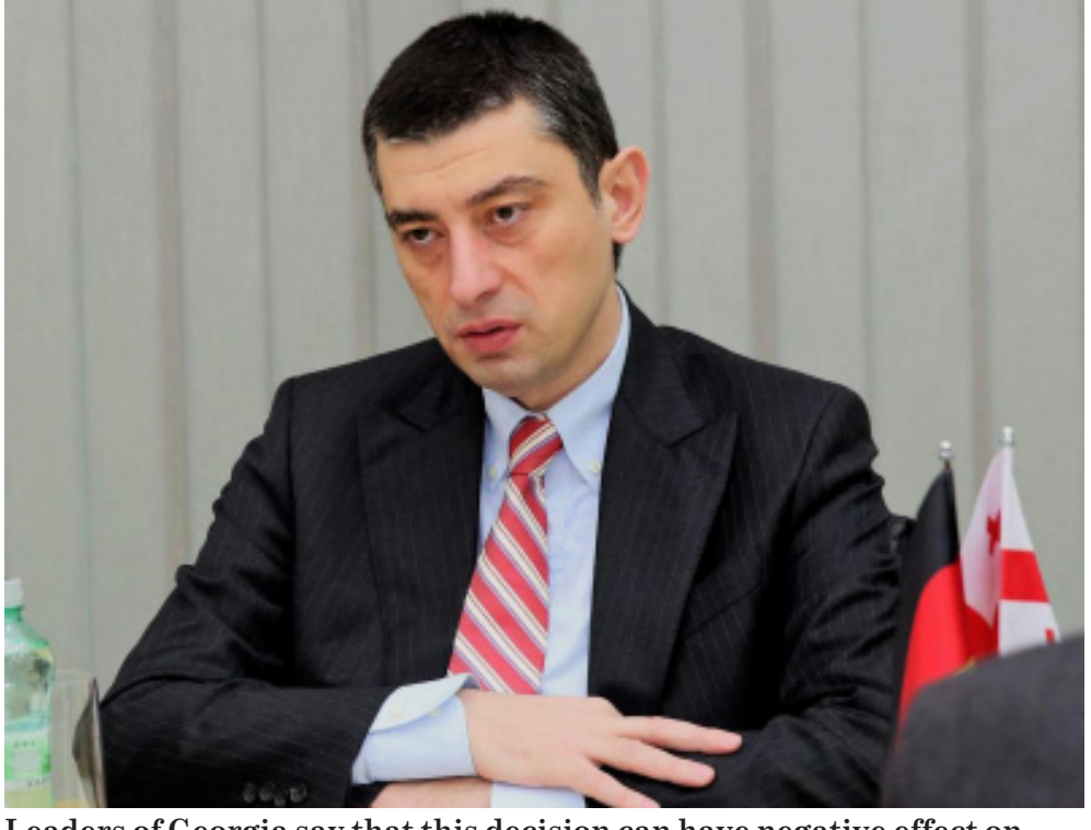
Leaders of Georgia say that this decision can have negative effect on relations between Georgia and Ukraine

Giorgi Gakharia, the Prime Minister of Georgia, said that the only reason why the government decided to summon the Ambassador is that the government is trying to find ways to save the relations between the countries.