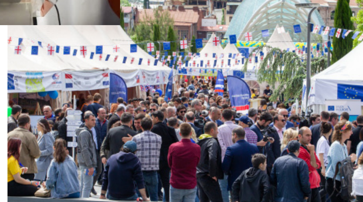
Europe Day celebrated in Georgia in 2019.