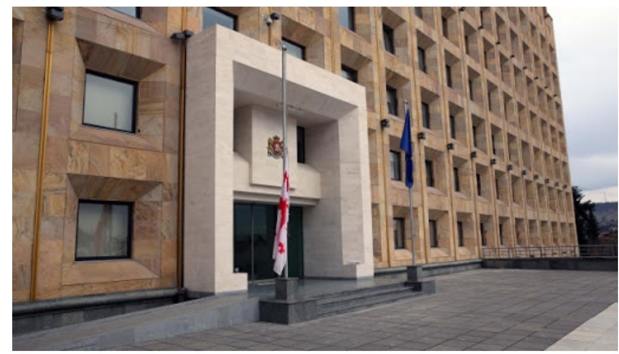
The presentation of the plan was held by the government's administration

The anti-crisis plans to relaunch tourism also provide benefits for travel companies and guides. In particular, they will