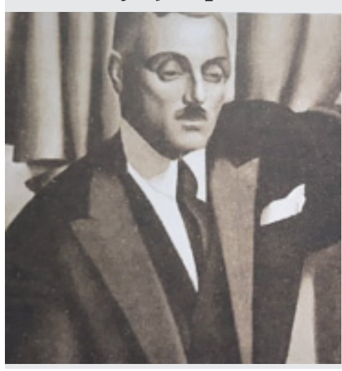
FULL STORY ON Page 4