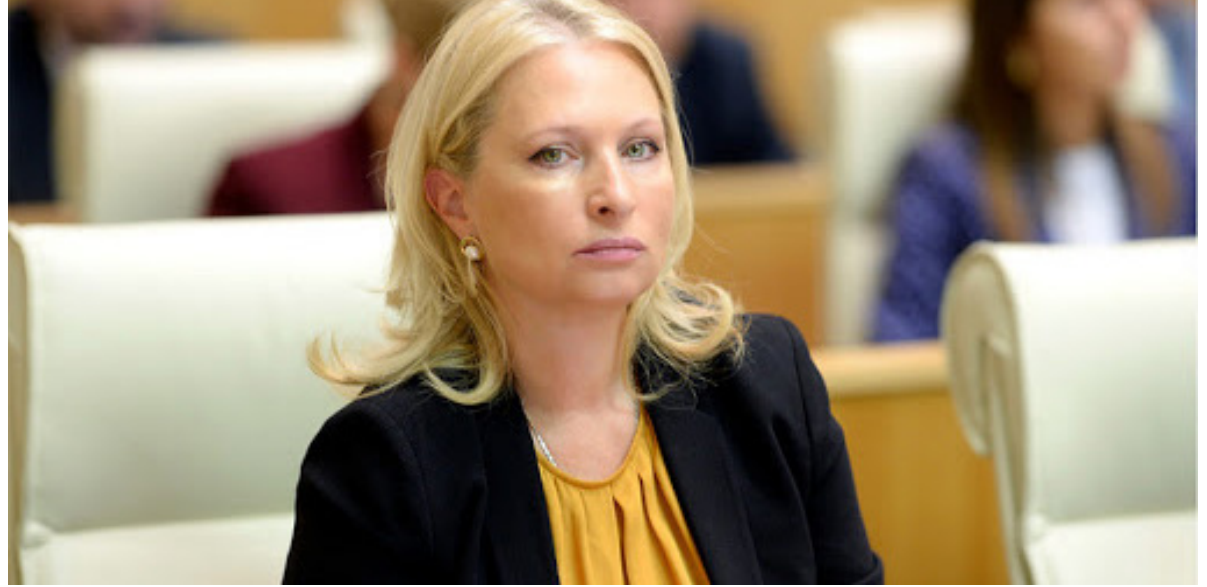
Turnava said that opening the borders is planned for July 1^{\rm st} .

In the third stage - from July 1<sup>st</sup>, international tourism will be launched. In particular, the opening of land and air borders in accordance with safe corridors and the gradual restoration of flights.