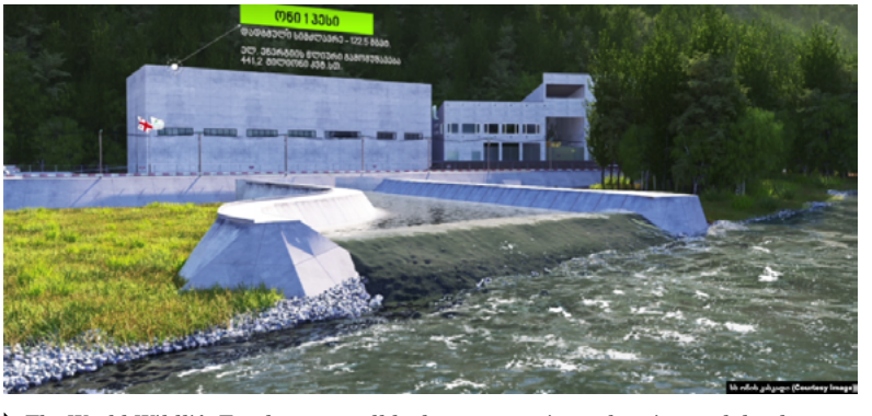
> The World Wildlife Fund opposes all hydropower projects planning and development of which does not meet internationally recognized standards and best practices.

JSC Oni Cascade, the project implementing company issued the announcement after the statement of political parties, non-governmental organisations as well as media coverage, calling all information false. They wrote that the construction of Oni Cascade is clearly designed for high seismicity and that a detailed seismic survey has been carried out, in particular, by the leading European company Studer Engineering GmbH. JSC argues that a number of important HPPs have already been built in the high seismic zone of Georgia, including the Shaori and Lajanuri HPPs with their reservoirs and writes: "None of the HPPs were damaged, neither for the environment nor for the local population during the powerful earthquake that struck in 1991." Rioni will not dry up and Oni will not turn into a desert - we read in the statement of JSC Oni Cascade. The argument is as follows: