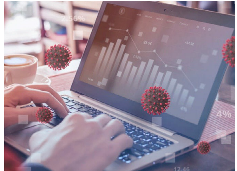
COVID-19 improving reassurance methodology.

The technological solutions needed for the insurance industry will be further developed next year. We must assume that insurance technologies and the current situation will help us to reassess the basics of insurance, which will have a positive impact on this industry as a whole in the future.