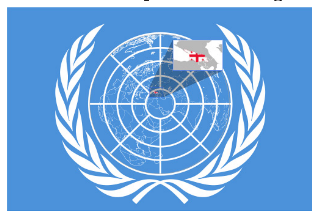
Georgia is one of the first 46 countries to receive $1 million from the United Nations to protect vulnerable groups from COVID-19 shocks.