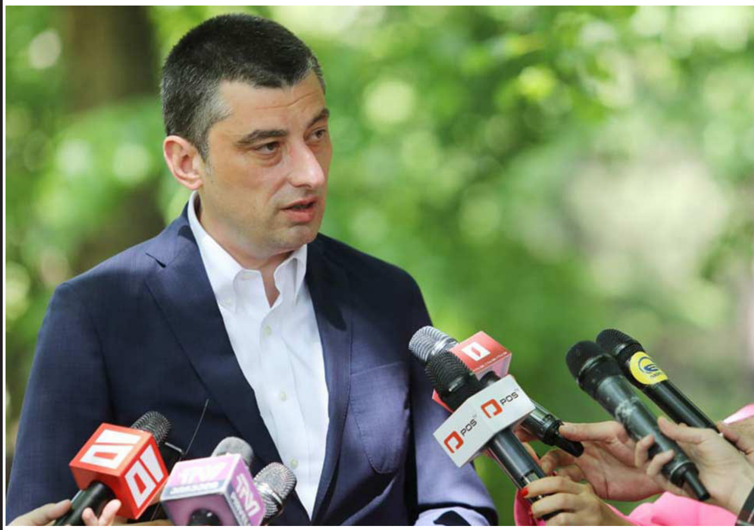
According to the PM, we still need restrictions, but we don't need the extension of curfew and state of emergency.

on Public Health in an expedited manner. The decision was made by the Bureau of the Parliament at the May 19 sitting. The Parliamentary Health Committee was named the leading committee.