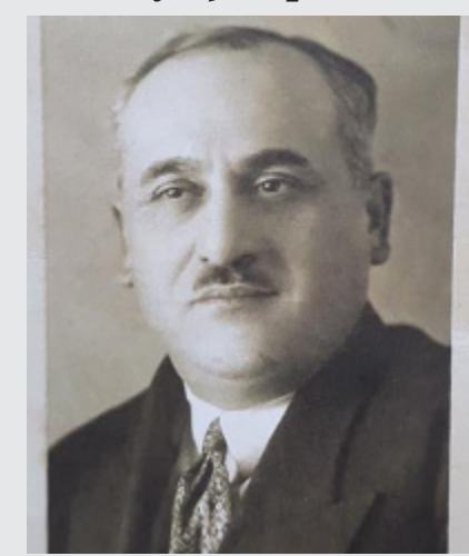
FULL STORY ON Page 4