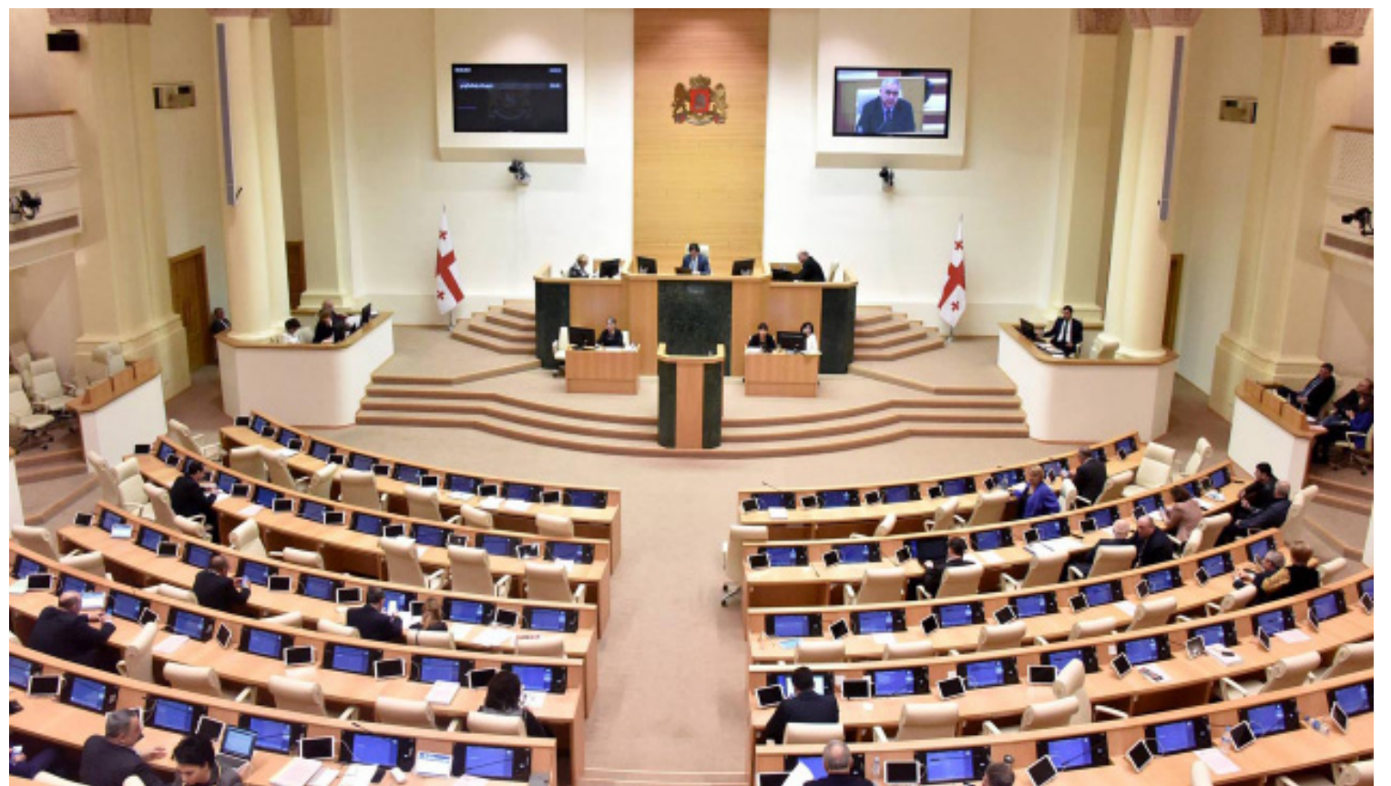
TIG says it is unconstitutional to carry out restrictive measures without declaring a state of emergency.

These rights, according to the Constitution of Georgia, are basic human rights and the basis and rules for their restriction are defined by the Constitution. E.g. Freedom of labor, professional and economic activity, and freedom of assembly may be restricted only by the President's