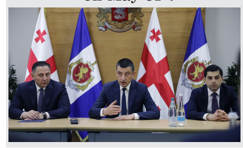
FULL STORY ON Page 2

Georgia celebrates the National Day of Police, Gakharia awarded 10 employees of MIA Police day is celebrated on May 31st.