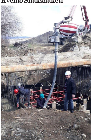
Irrigation System Rehabilitation Process, Skhvilisi