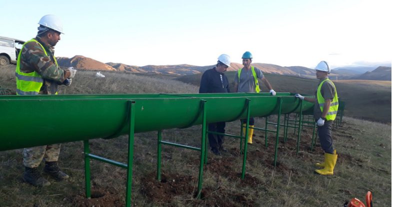
Cattle Waterings, Tkemlana