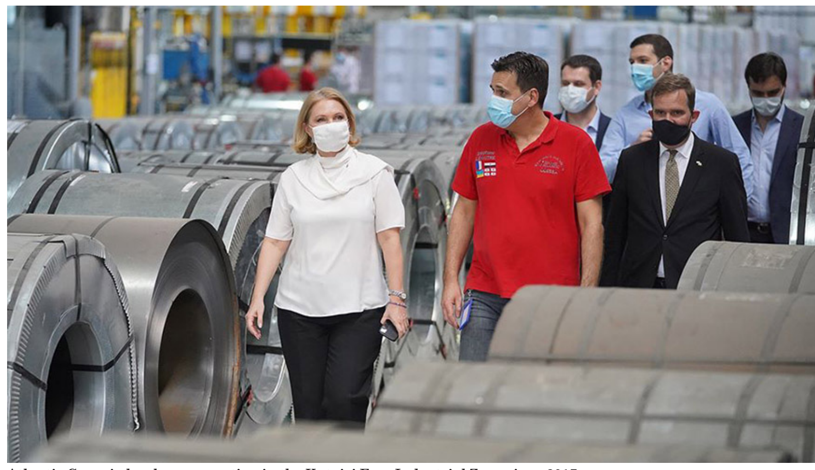
Atlantic Georgia has been operating in the Kutaisi Free Industrial Zone since 2017.

The company plans to increase the production of water