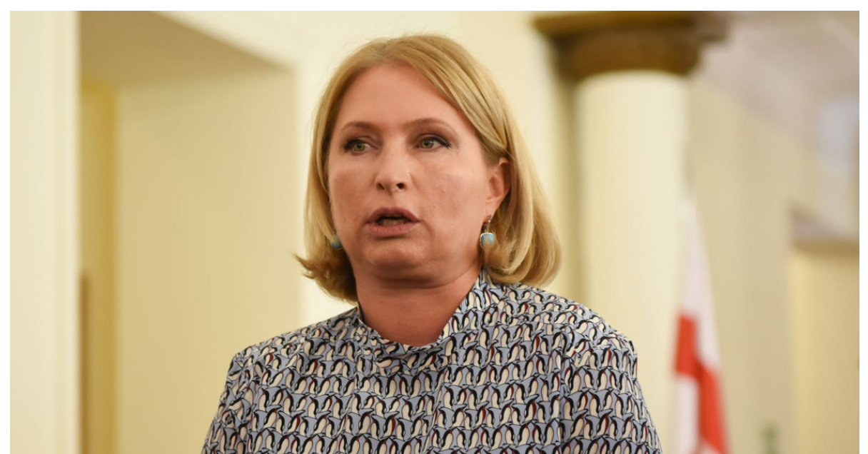
Turnava says that the economy will continue to drop.