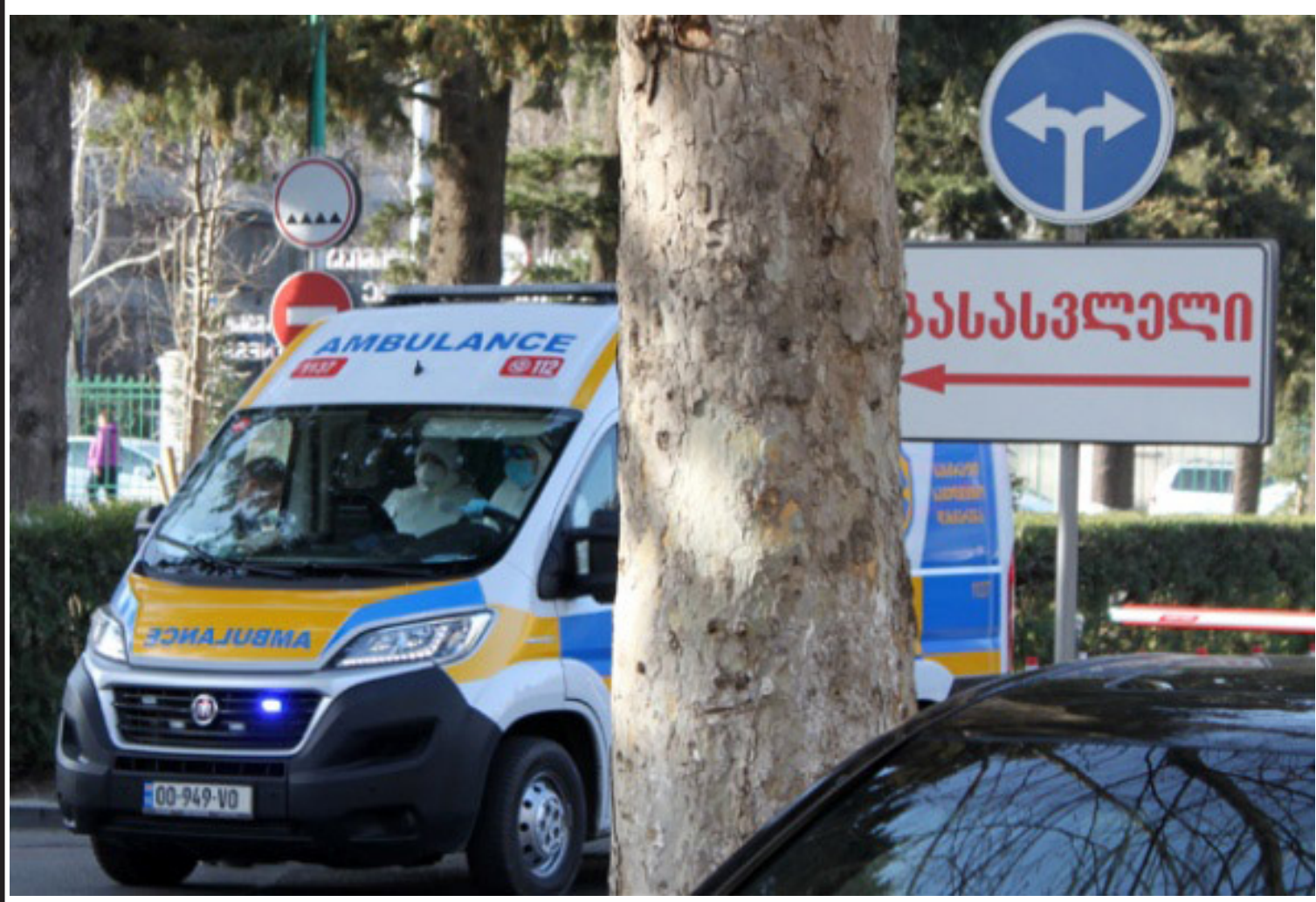
26 new cases were reported in Georgia yesterday.