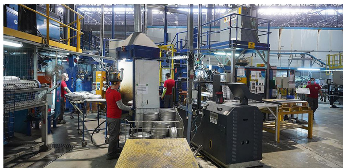
The company employs about 140 people in Georgia, and plans to increase the number of employees.

"It is important that despite the global crisis, pandemic and challenge, the company's plans have not changed and, on the contrary, they are thinking more about expanding production, and employing more people. Therefore, we will always have strong support," added the minister.