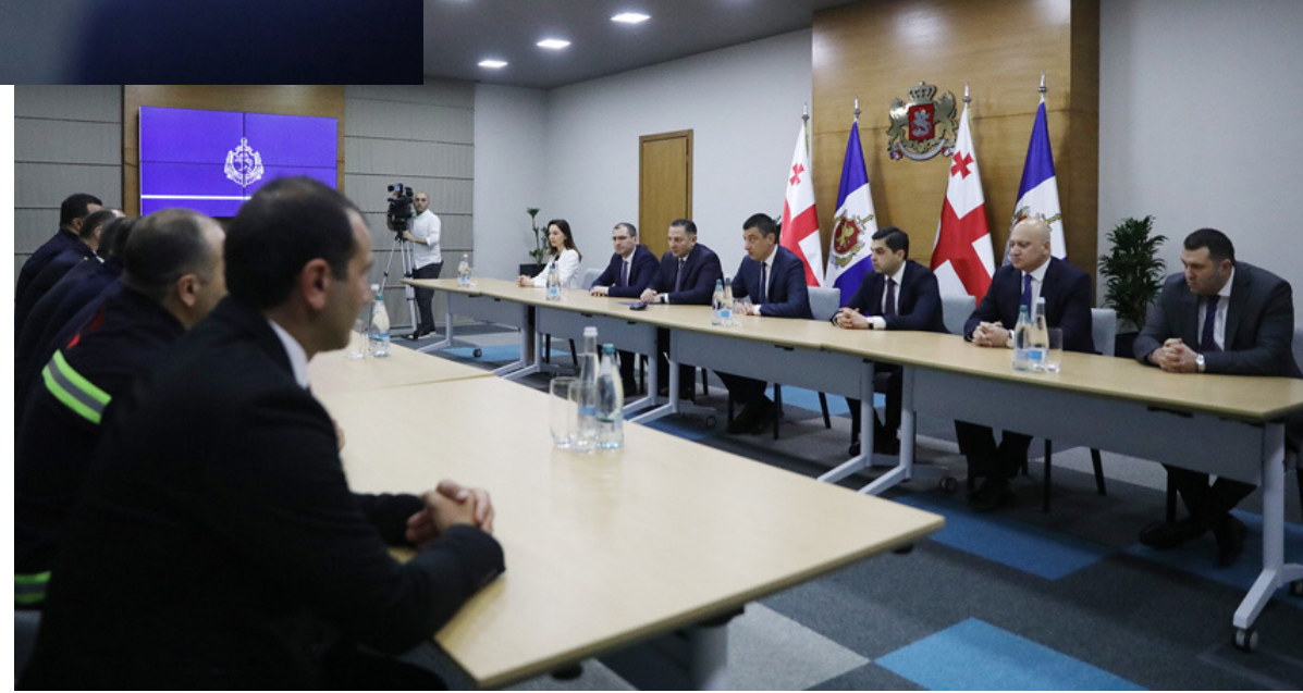
The US Embassy also congratulated 'Police Day.'

In Georgia, Police Day is celebrated on May 31<sup>st</sup>, this year, because of the pandemic, the celebration was not held.