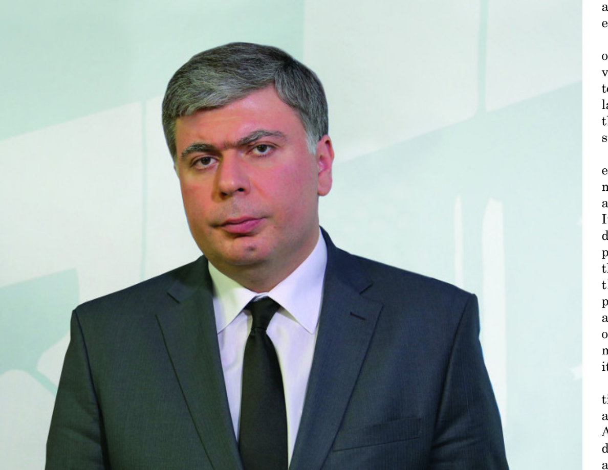
ia TBC's chief economist says there's a room for positivity amid the opening of the economy.

"One is our balanced macroconomic policy, the balanced monetary and monetary leverage we use, and this is normal. It must be said that slowing down economic activity also plays a role," she said, adding that this is a balancing process that will ultimately have a positive impact, as it will have a positive effect on the prices of imported goods and will ultimately help return inflation to its target. Note that the National Statistics Office (Geostat) reported annual inflation in May - 6.5%. As Geostat explains, it was driven by price changes in food and non-alcoholic beverages, and transport services.