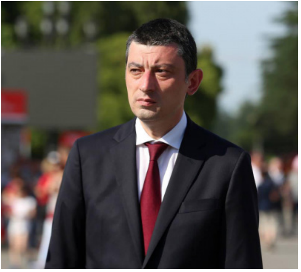
▶ The Prime Minister of Georgia, Giorgi Gakharia.

On June 9th, the representatives of relevant authorities held a meeting with the PM, Gakharia, where the criteria for renewing international