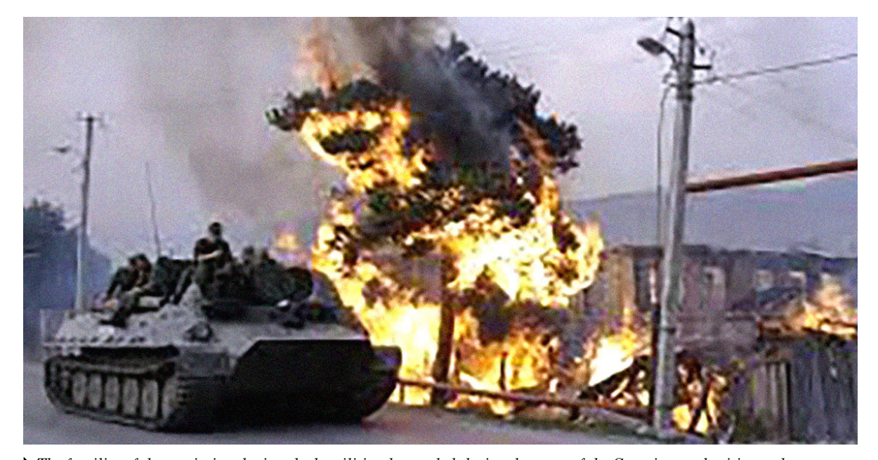
▶ The families of those missing during the hostilities demanded the involvement of the Georgian authorities and competent experts in the process of identifying the remains found in the occupied territories.

Representatives of the Tskhinvali office of the International Organization meet with the representatives of the defacto government to find out the details.