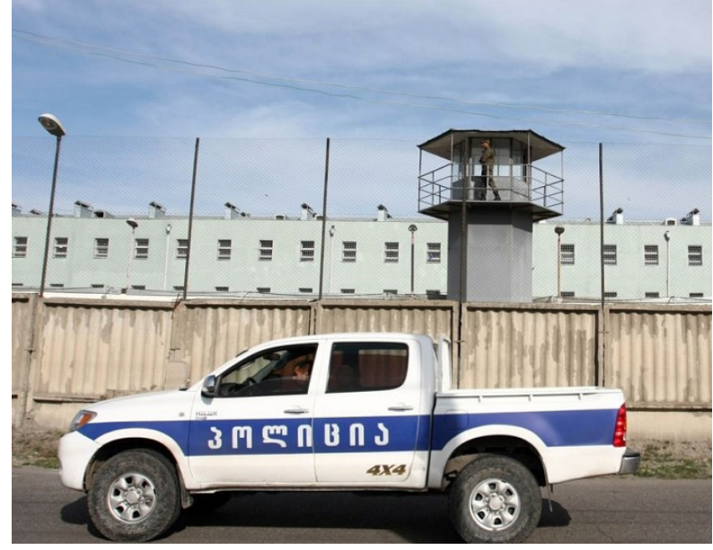
▶ Penitentiary Establishment No 17

"It is impossible to keep physical distancing or to properly protect sanitary conditions in the cells. Thus, in the context of the pandemic, it has become even more urgent to implement the recommendation made by the Public Defender years ago and endorsed by the Ministry of Justice on transformation