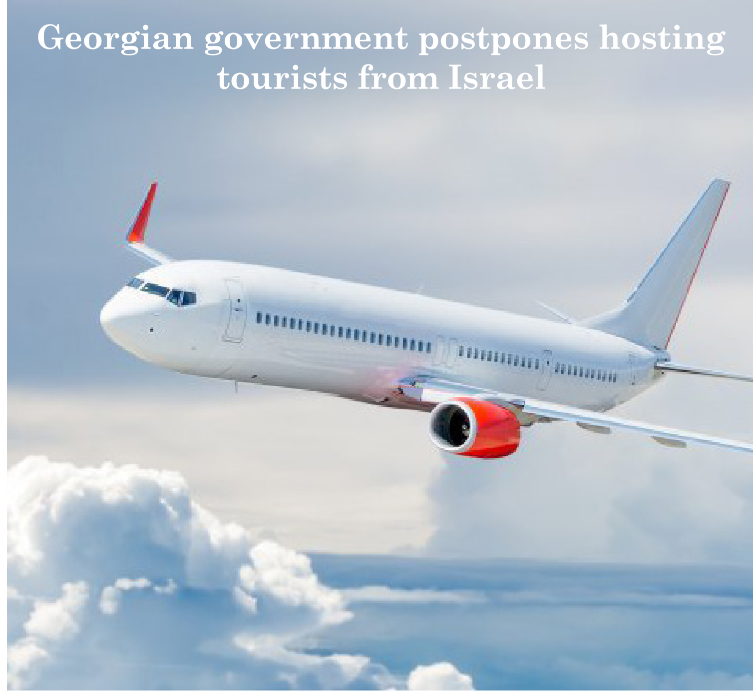
▶ Georgia will host tourists from July 1<sup>st</sup>.