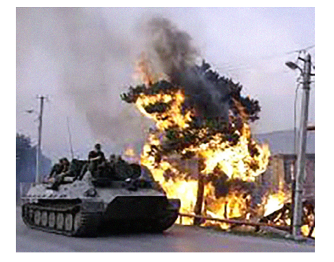
FULL STORY ON Page 2

De facto government declares the remains found near Tskhinvali practically identified