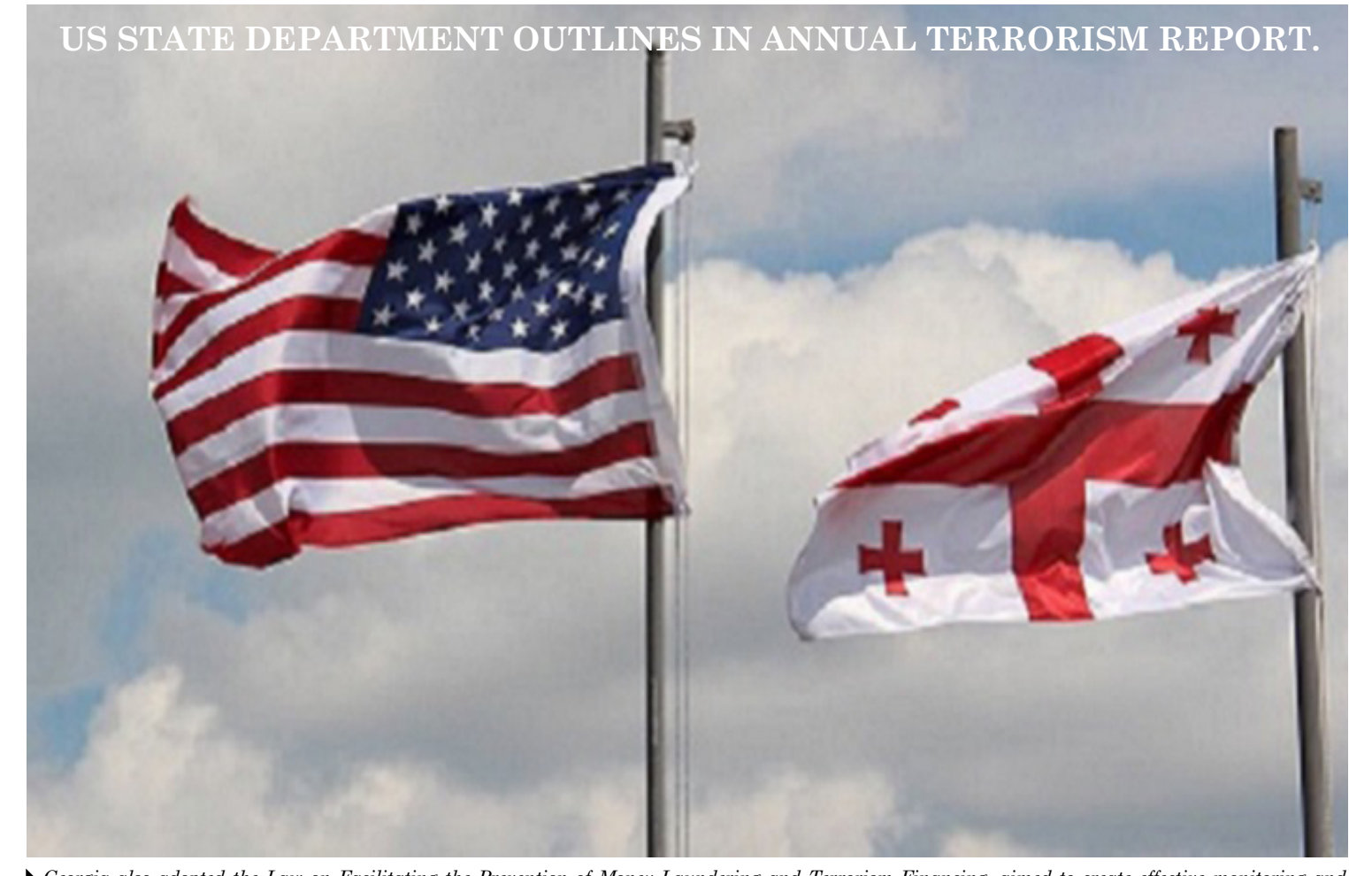
▶ Georgia also adopted the Law on Facilitating the Prevention of Money Laundering and Terrorism Financing, aimed to create effective monitoring and enforcement mechanisms, enhancing the ability of law enforcement to retrieve information from the Financial Monitoring Service.

its own branches and encouraged its followers to attack.' At the same time, the State Department notes that last year both Iran and the Islamic State and al-Qaeda suffered serious defeats, including the killing of some high-ranking commanders.