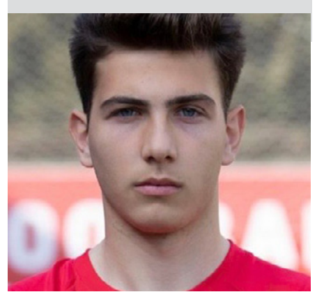
FULL STORY ON Page 2