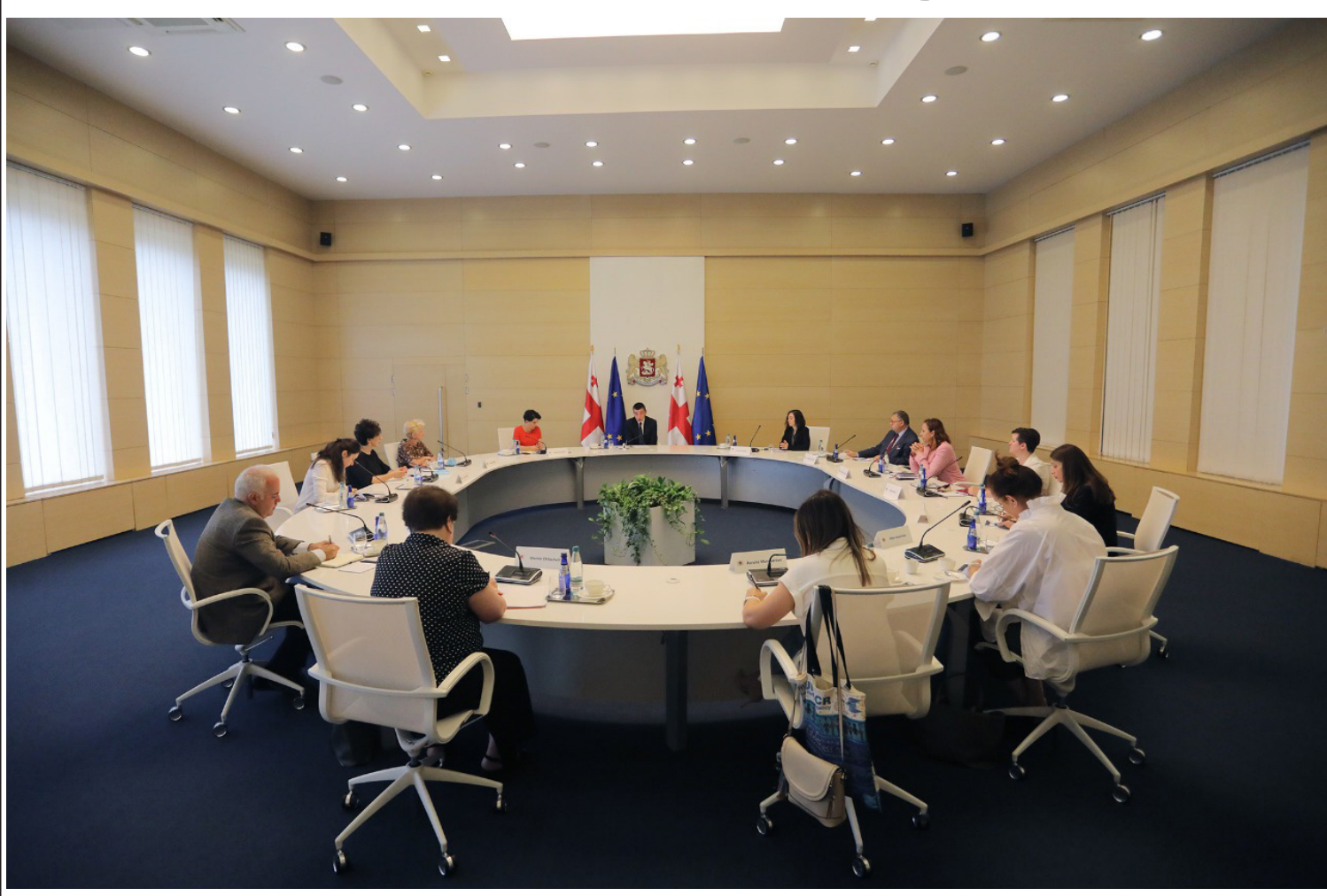
The meeting was attended by the PM, head of the gov't administration, and international partners.