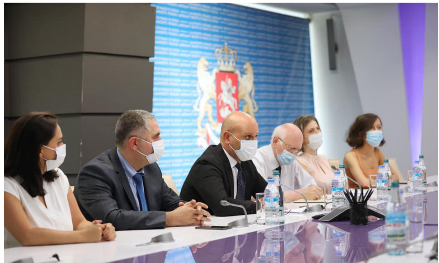
The document provides for the allocation of a soft loan of about 170 million euros and a grant of 28.5 million euros to Georgia

Only shortlisted persons will be notified by email and invited to the interview. Interested candidates are required to send the CV (only in English) with two contact information from previous workplaces/schools and copies of certificates to: gg_oso_rep@jica.go.jp and jicageorgia@gmail.com; no later than 14 August, 2020.