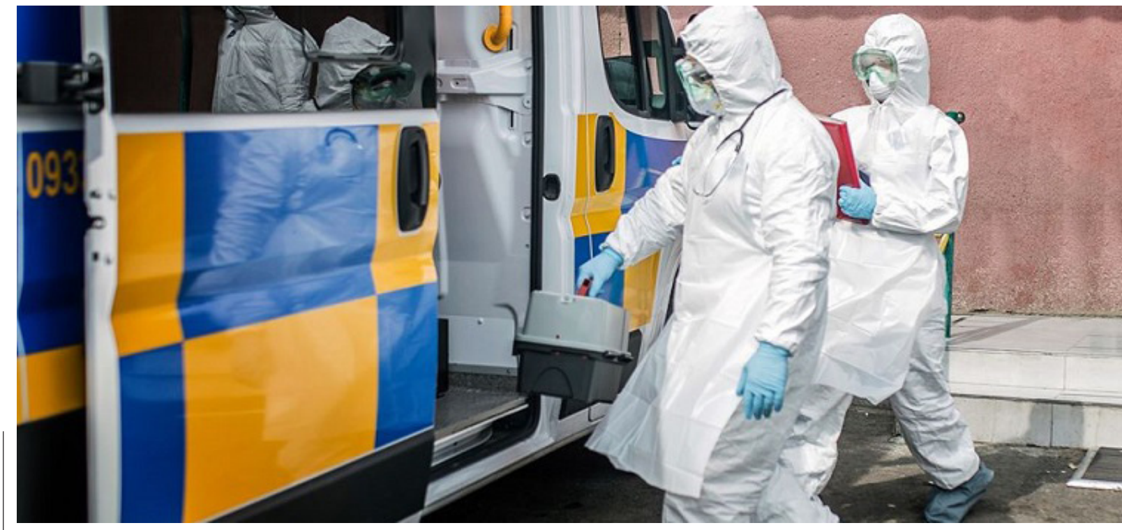
Over 1177 cases of Coronavirus have been reported in Georgia.

Day Showers High: 26°C Night Partly Cloudy Low: 18°C