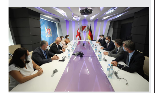
FULL STORY ON Page 3

The document was signed between the Ambassador of Germany and Georgian Finance Minister