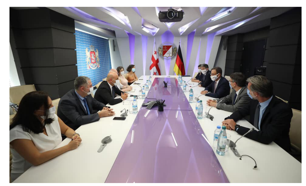
There are several different priority areas mentioned in the document