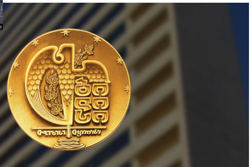
The journalistic investigation describes how Tbilisi City Hall arranged a $ 30 million tender to a specific company and how potential suppliers justify the City Hall's discriminatory approach.

In the last 5 years, the company has signed tenders worth ₾ 5 million with the Tbilisi City Hall, including the introduction of ISUZU green buses by the same company.