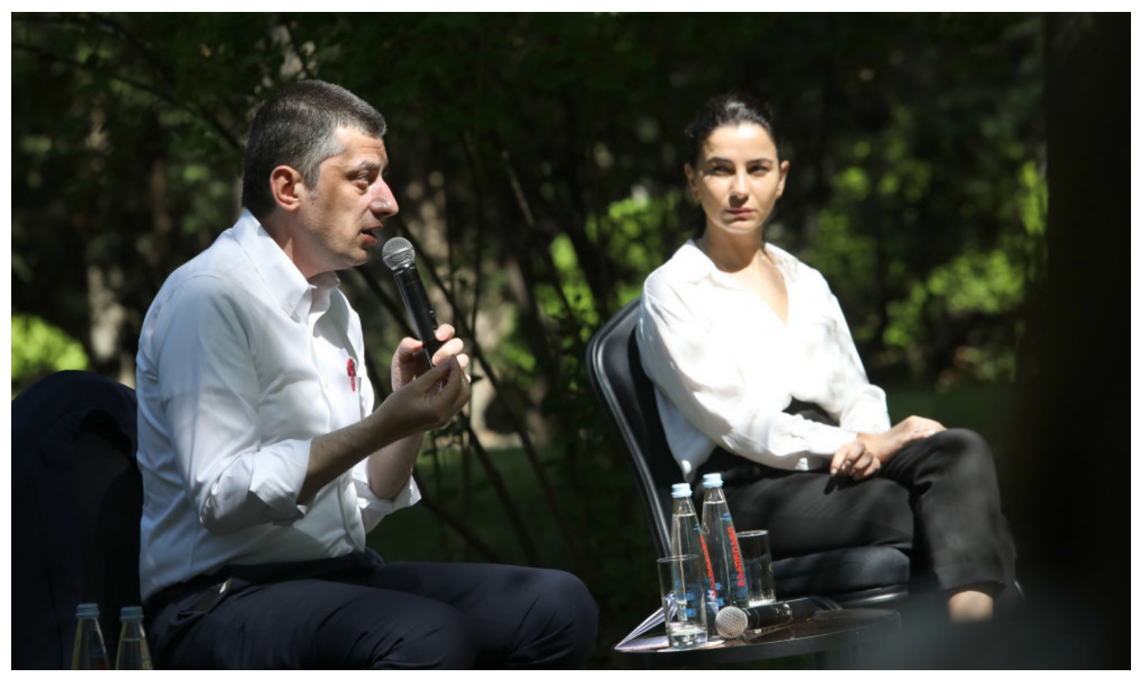
"The tourism sector is a sector that is still under serious pressure, so we must do everything we can to help this sector," he said.