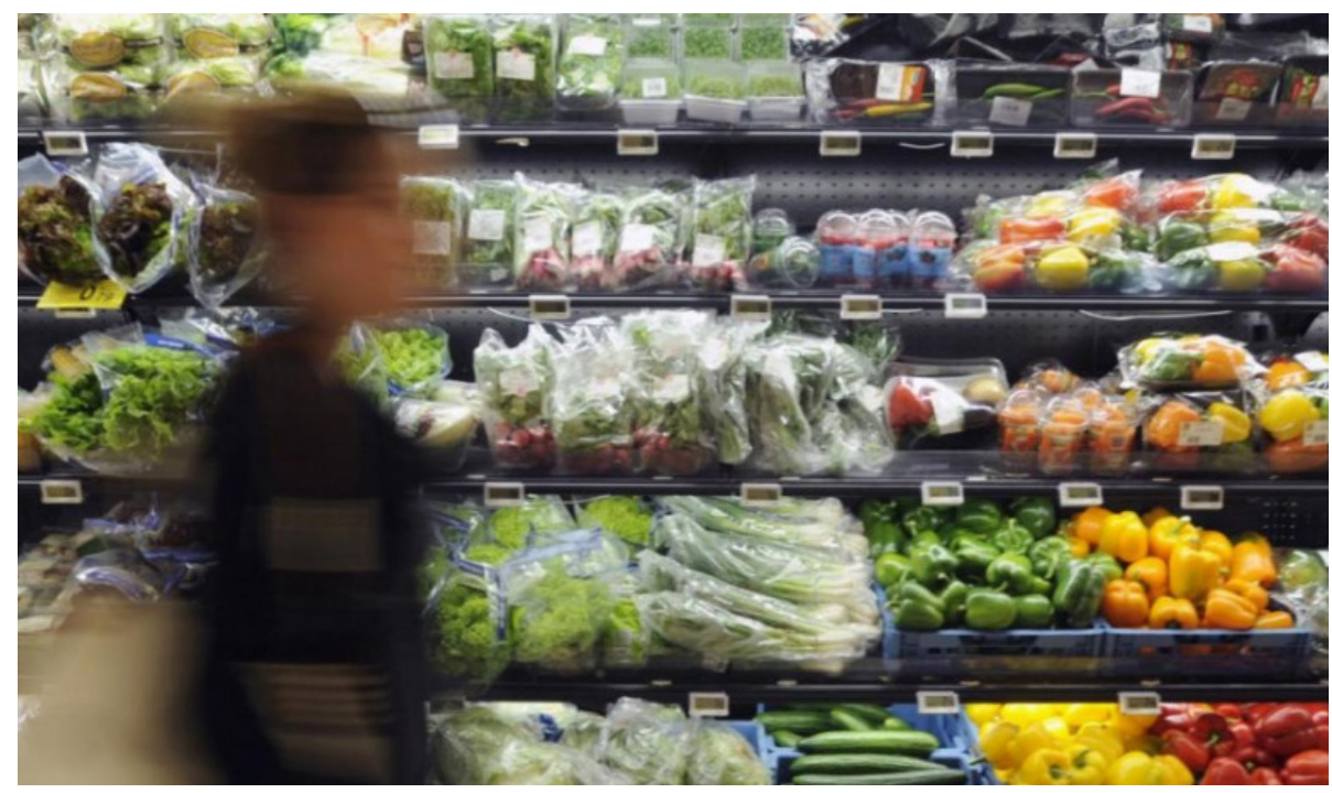
▶ The most significant impact on the rise in prices was the rise in food and non-alcoholic beverage prices.

According to the report published by Geostat, in the second quarter of this year, compared to the same period last year, the