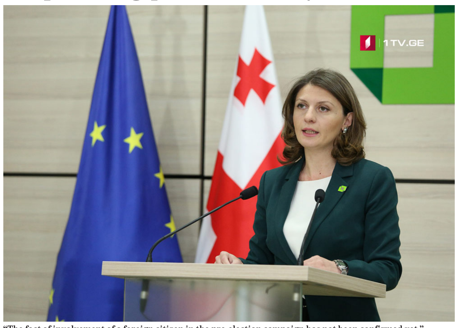
"The fact of involvement of a foreign citizen in the pre-election campaign has not been confirmed yet," Mikeladze said yesterday morning.

are any, will be held on November 21^{\rm st} . If the runoffs are held December 10 is the deadline for summarizing final results.