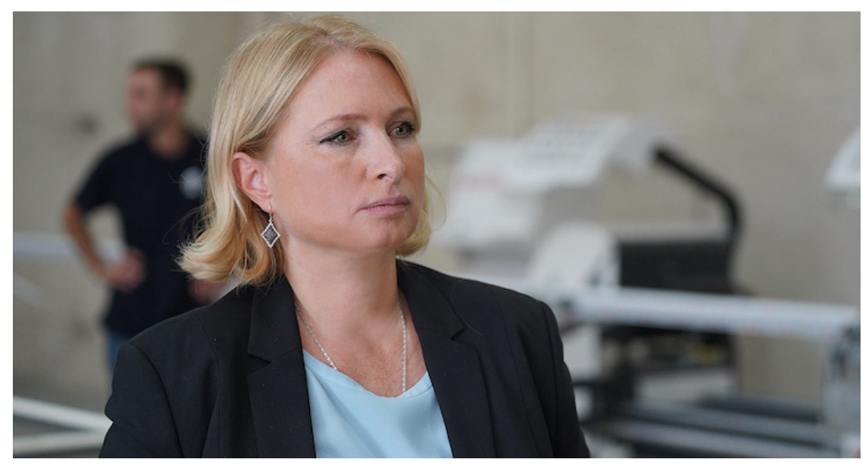
According to the 6-month statistics, foreign investments in Georgia are at a 10-year minimum.