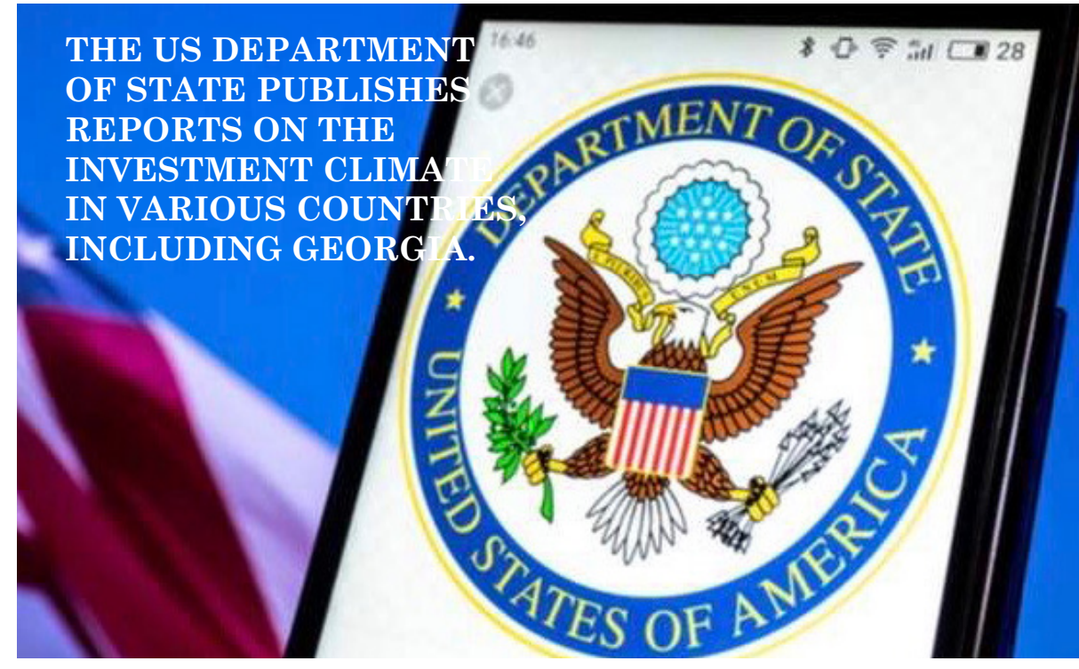
Georgia ranks 7th in the World Bank's 2020 Ease of Doing Business ranking and 12th in the Heritage Foundation's Economic Freedom Ranking.

"Overall, business and investment conditions are solid. However, some companies have expressed a growing lack of trust in the judiciary in terms of competently, timely, or independently reviewing commercial cases. Some business disputes linger in the court system for years. Other companies complain about inefficient decision-making processes at the municipal level, shortcomings in the implementation of intellectual property rights, lack of effective antitrust policies, selective enforcement of economic legislation, and difficulties in resolving property rights disputes. The Georgian government continues to work to address these issues and, despite the challenges, Georgia holds a high position in the region as a good place to do business," the document reads.