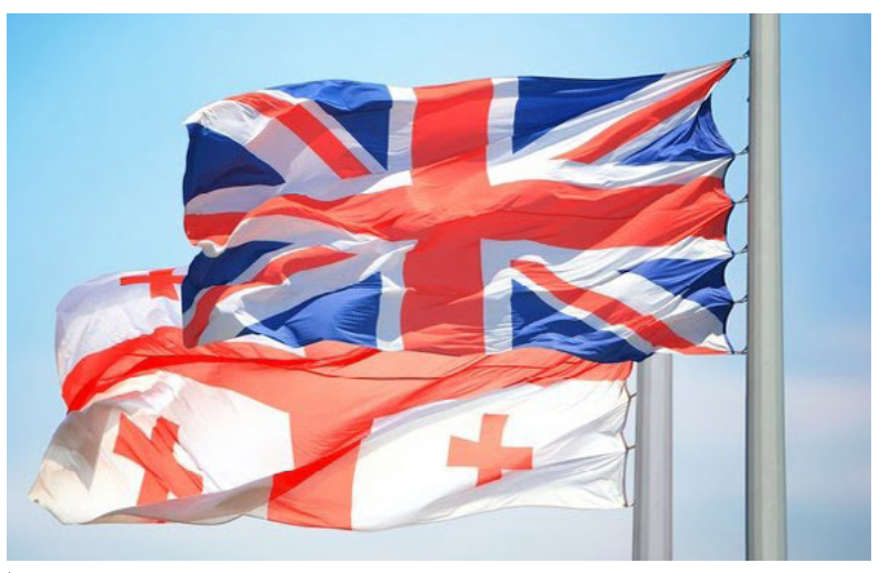
Georgia and Britain have signed a plan for the financial year of bilateral cooperation in the field of defense.

The parliamentary dimension of the Platform was launched in 2017.