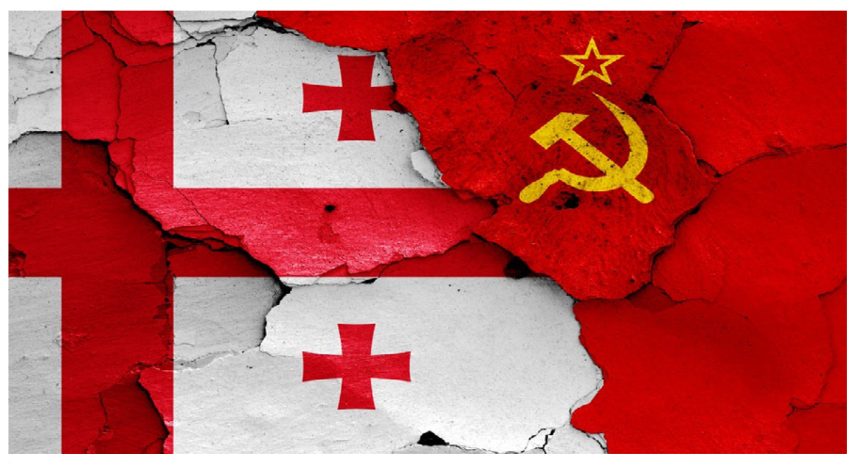
The document also talks about the post-Soviet challenges that Georgia faced in the 1990s.

The report states that Georgia is a world leader in terms of ease of doing business and the current business environment in Georgia is positively characterized. Georgia's leading positions in such areas as the World Bank Doing Business and Transparency International Corruption Perceptions Index are high-