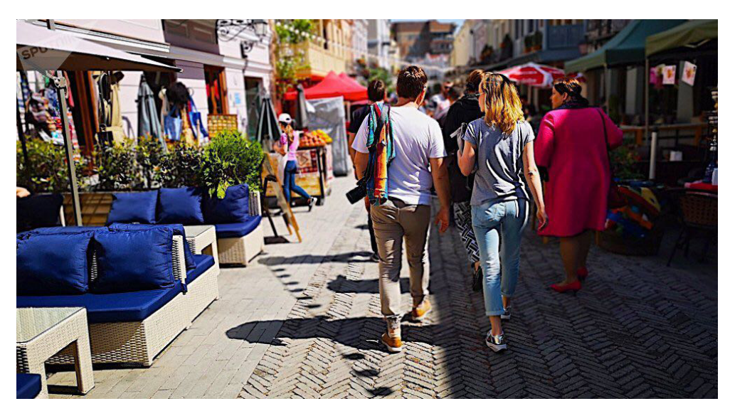
The volume of expenditures made by local visitors in January-June decreased by 10.2% and amounted to 649 million.

The Geostat report also discusses the goals of the visitors, their expenses and the regions they visit. Statistics show that the main purpose of visits in the second