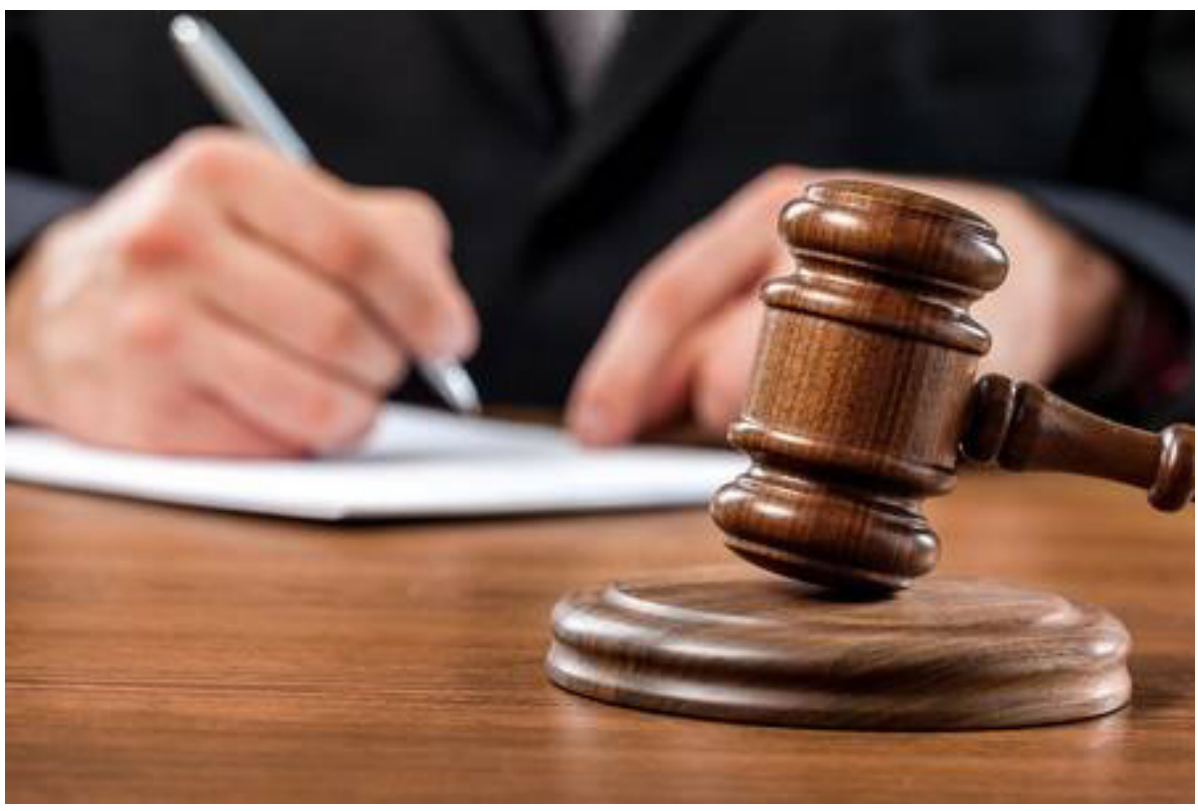
The draft law has been prepared according to the recommendations

Day Showers High: 29°C Night Partly Cloudy Low: 18°C