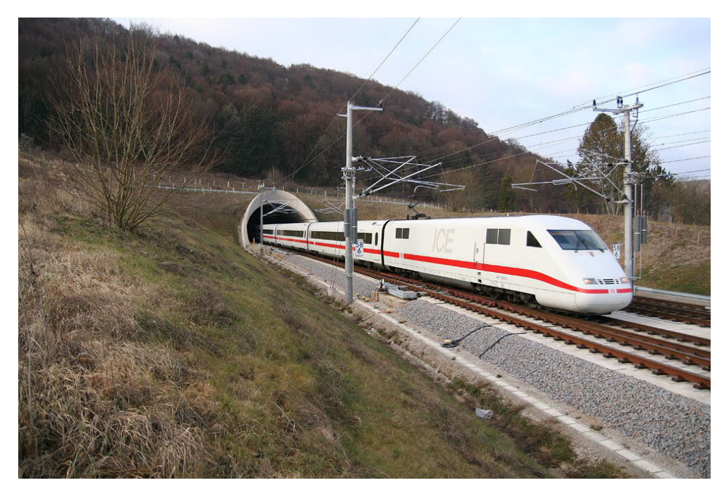
The intercity traffic in Georgia was banned until June 8th.