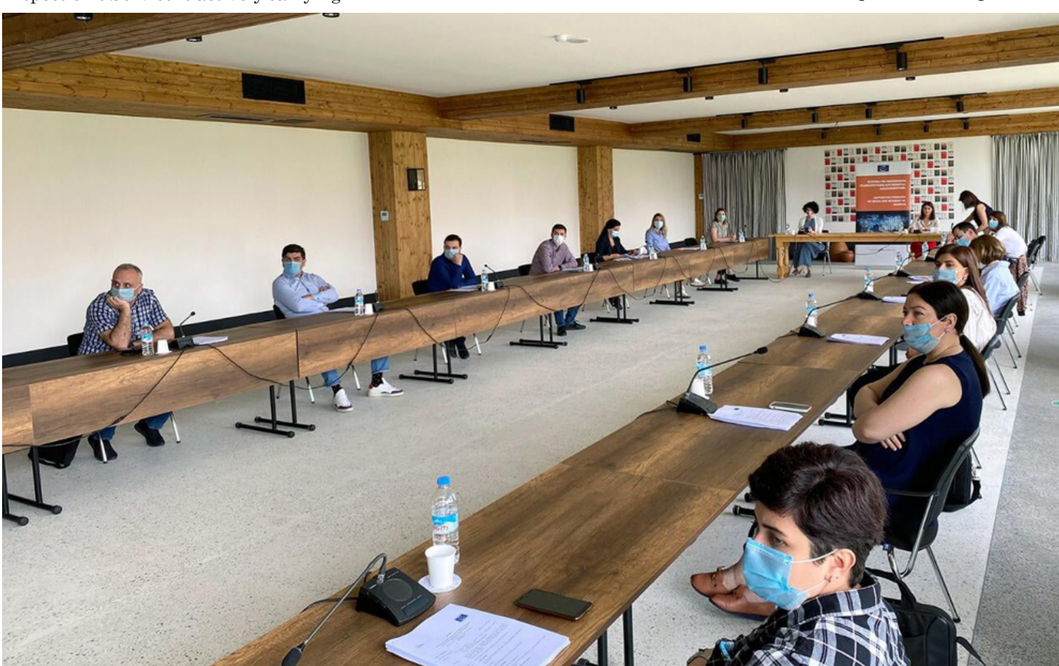
A tel-day training was implemented with the assistance of the Council of Europe project Supporting Freedom of Media and Internet in Georgia.

out various measures. SIS has already issues of protecting personal data and has assigned a group that will consult the employees of the Central Administration