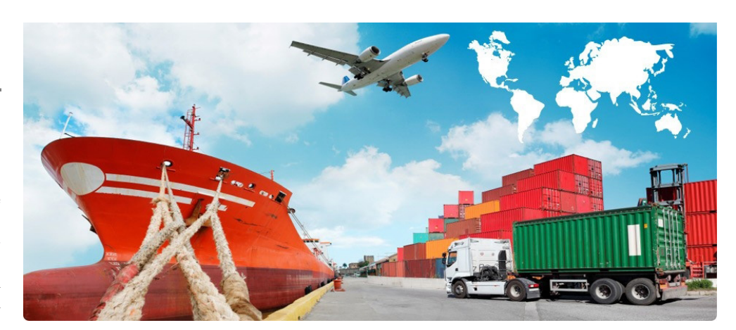
Copper ores and concentrates are on top of the list of export commodities.

The top import commodities in January-August 2020 were motor cars whose imports equaled $481.6 million (9.7 % of the total imports). The petroleum and petroleum oils followed in the list with $325.1 million or 6.6 % of imports. The Copper ores and concentrates were third in the top import commodity list with $312.1 million (6.3 % of imports).