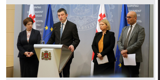
FULL STORY ON Page 3

PM and business representatives discussed current challenges