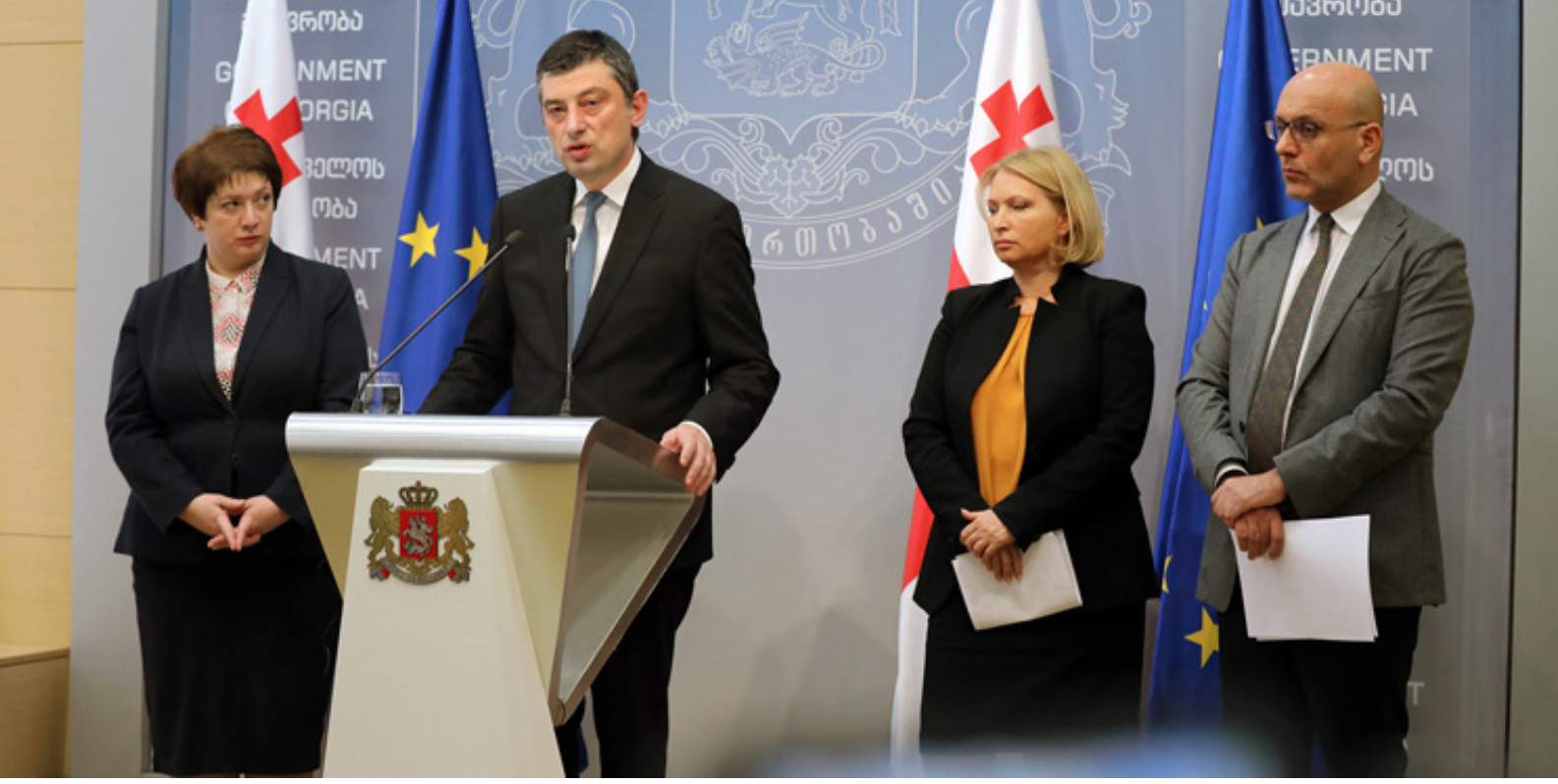
Gakharia spoke about the state strategy at the stage of adaptation to the virus

The Prime Minister Giorgi L Gakharia met with business representatives in the administration of the government of Georgia. The meeting was held to discuss ways of helping the business sector to overcome the challenges raised by the Covid-19 pandemic. Over the last week, five business associations sent PM