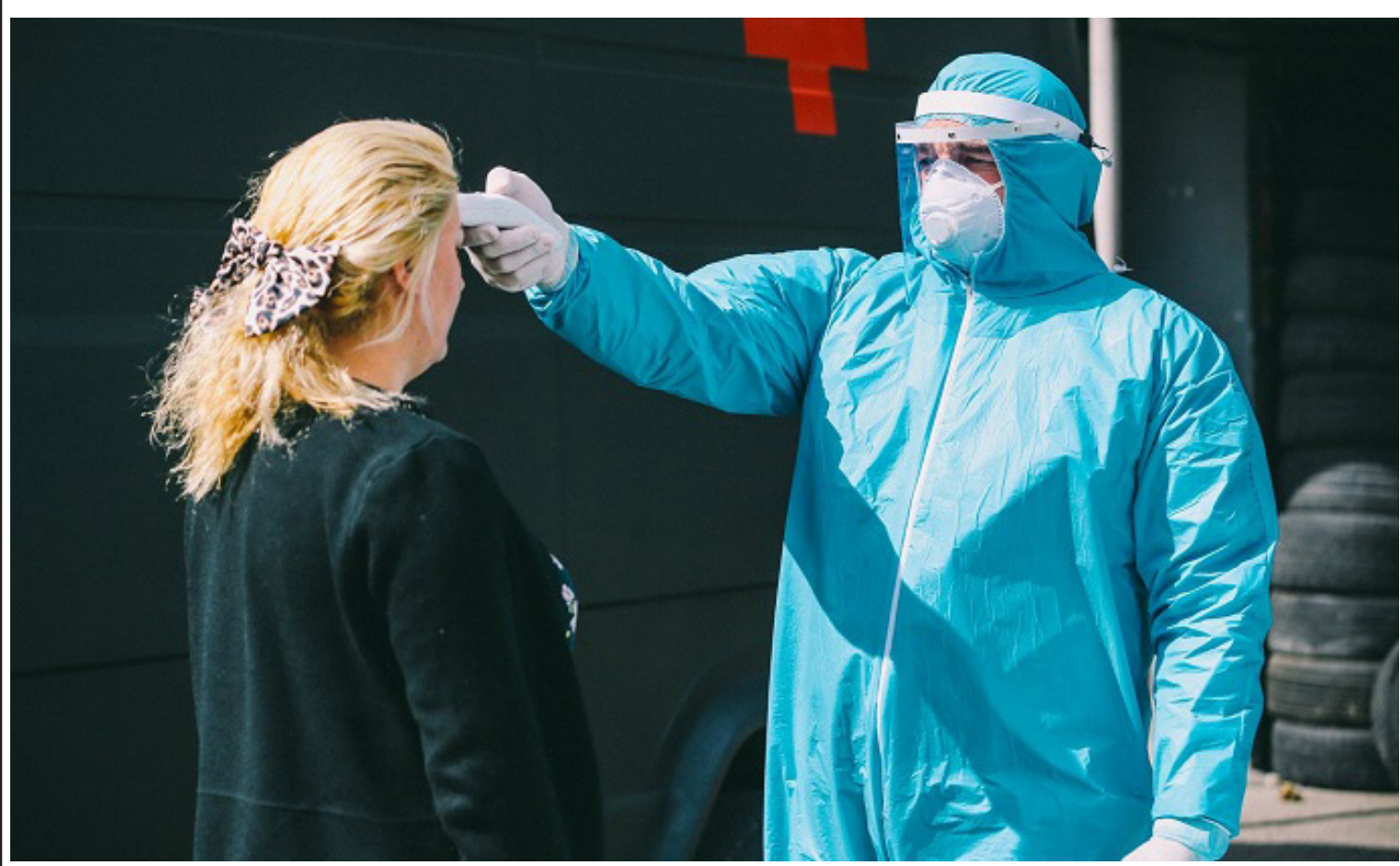
Number of Covid-19 cases in the country have increased significantly, especially in Tbilisi, Adjara, and Imereti

the Ministry of Internal Affairs in case of receiving such calls in future.