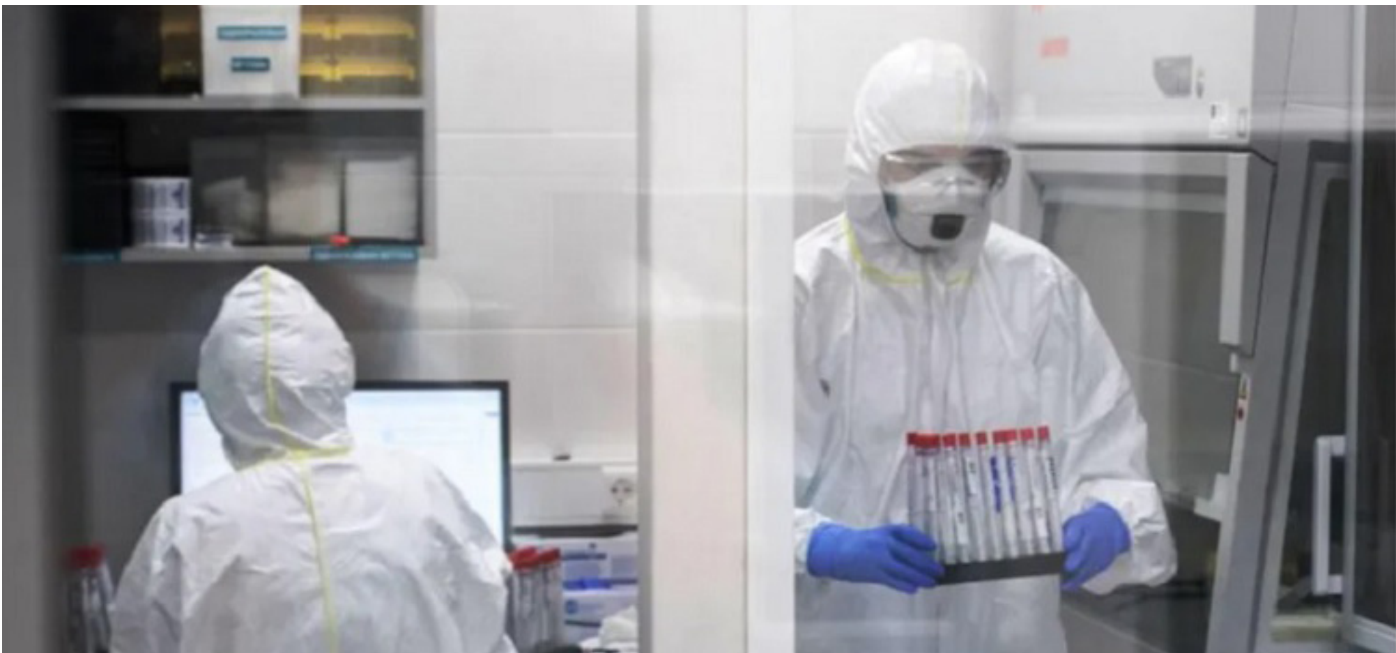
Over the weekend, a total of 3869 new cases of the Coronavirus was reported in Georgia

As of now, the government isn't planning on another lockdown or further tightening of restrictions.