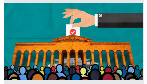
FULL STORY ON Page 2

NGOs release assessment reports on 2020 parliamentary elections in Georgia