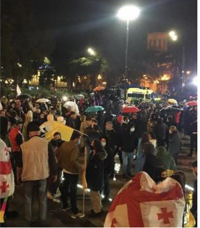
According to the preliminary data of the CEC, the Georgian Dream won 48.22% of the votes in the parliamentary elections.