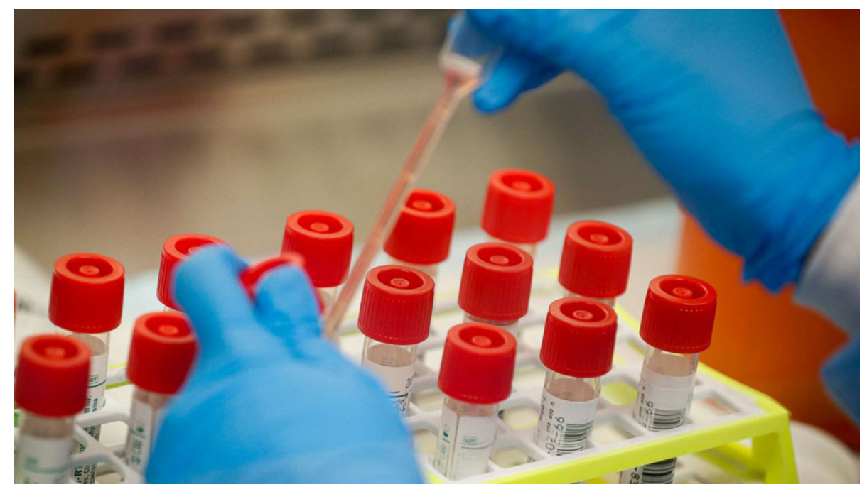
The number of active cases of infection stands at 15,411.