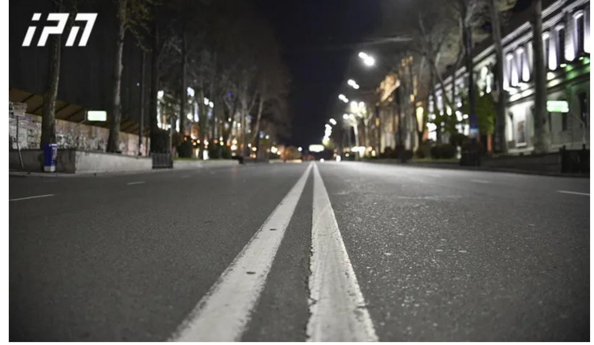
Ban on mobility from 22:00 to 05:00, applies to both walking and driving.