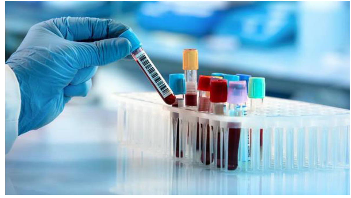
On November 9, Georgia reported 2927 new cases of coronavirus, 2470 recoveries, and 24 deaths.