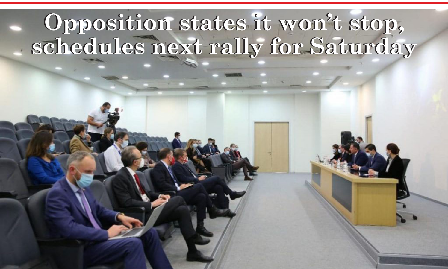
Vakhtang Gomelauri briefed representatives of embassies and international organizations regarding the November 8 rally in front of the CEC.

"The imposition of a curfew by the Georgian government on November 9 is further evidence that Article 453 of the