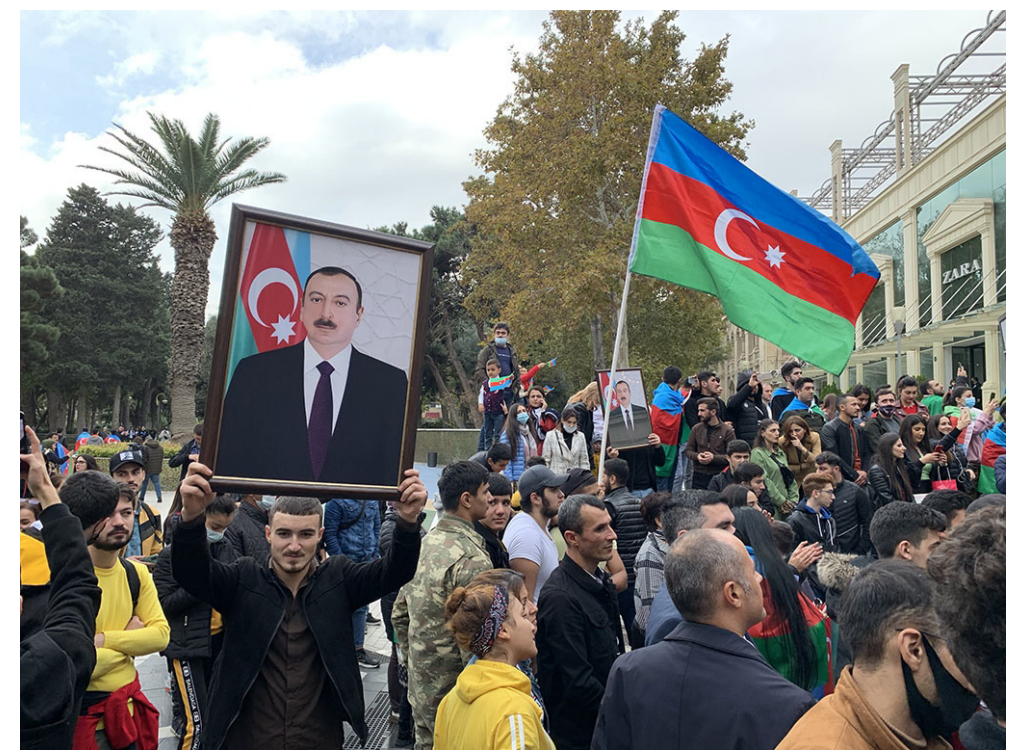
President Aliyev said the agreement was of 'historic importance,' and amounted to a 'capitulation' by Armenia.

Internally displaced persons and refugees shall return to the territory of Nagorno-Karabakh and the surrounding areas under the control of the United Nations High Commissioner for Refugees; Prisoners of war and other detain-