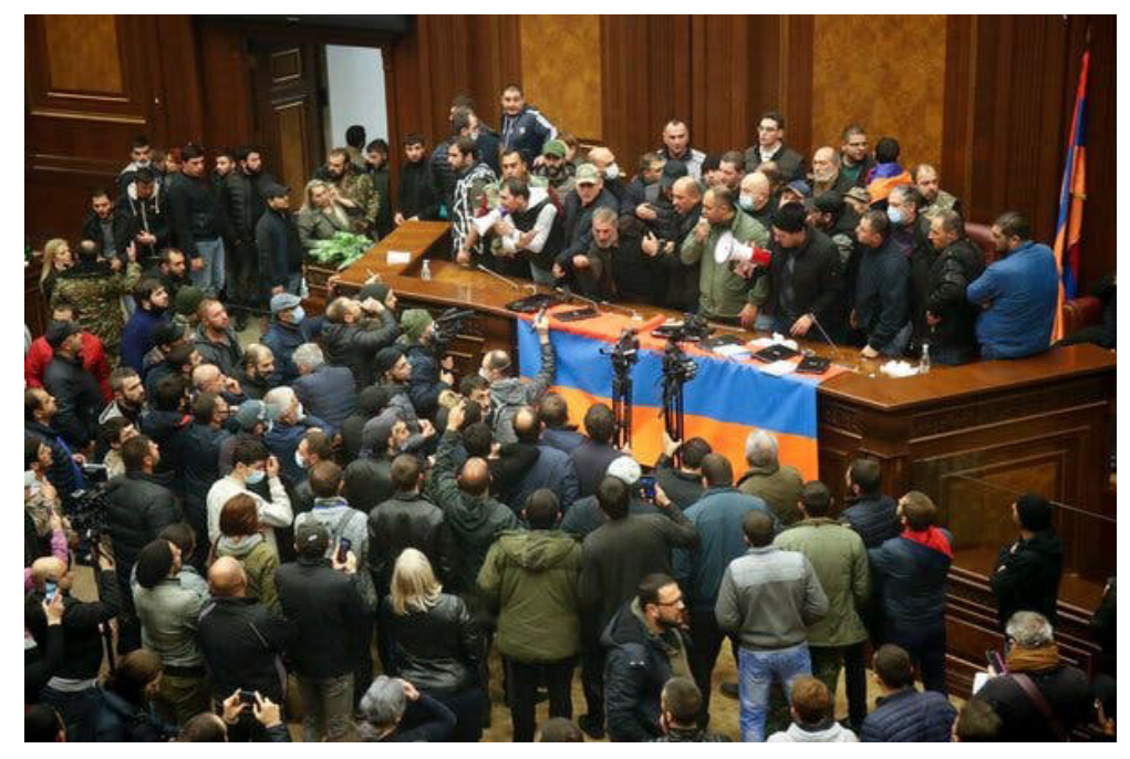
Defeat sparks crisis in Armenia.