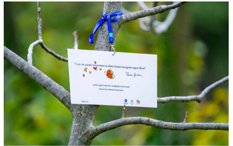
Recently, the Italian Embassy held an event dedicated to the 100 th anniversary of the birth of

The initiative has a symbolic significance and indicates the cultural proximity between Italy and Georgia and the great interest in the art of Tonino Guerra and Federico Fellini in Georgia.