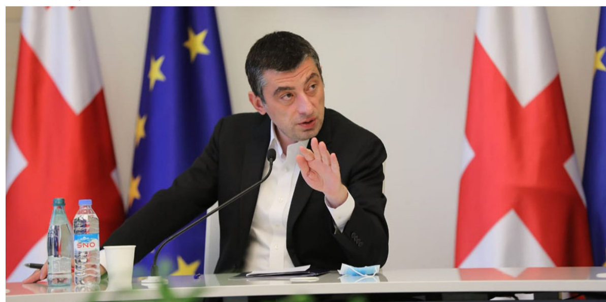
PM Gakharia met with the executives of private healthcare facilities