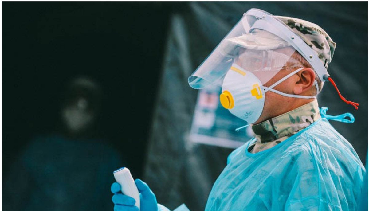
Total of 6524 new cases of the Covid-19 were reported in Georgia over the weekend

PM Gakharia once again noted that the country will continue its path of precision-targeted and localized approaches. As he said, there are no systemic restrictions placed by the gov-