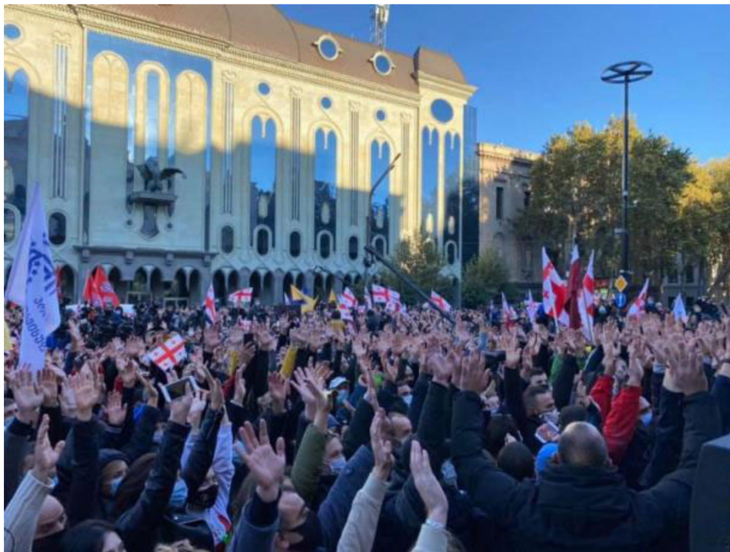
Opposition continues rallies in Tbilisi

The parliamentary elections were held in Georgia on October 31. As the Election Administration of Georgia reported, the Georgian Dream party got 48 percent of the votes in the election, the UNM got 28 percent. A total of 9 political parties managed to get more than 1% of the votes, which is needed to be part of the Parliament.