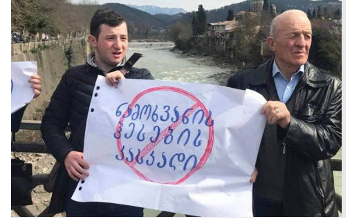
FULL STORY ON Page 3

NGOs respond to rally dispersal against Namakhvani HPP by using police force