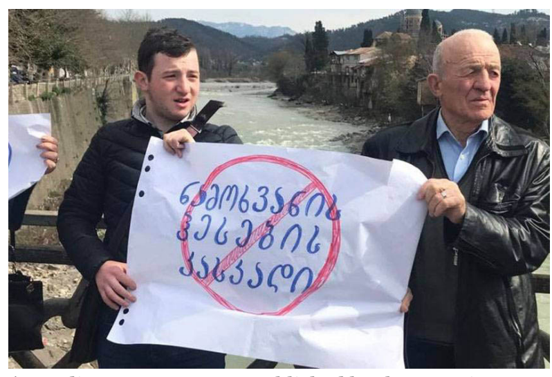
According to a statement published by the organizations, as of November 15, residents of village Zhoneti had been protesting the construction of the Namakhvani HPP cascade for 21 days.