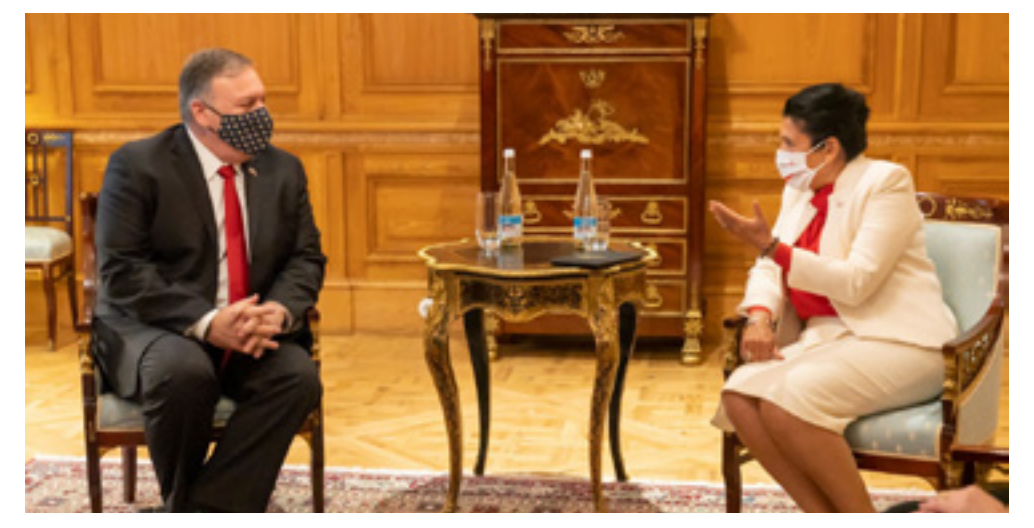
> The President noted that the friendship between the two countries, which spans three decades, has never been called into question as it is based on shared values - democracy, the rule of law, and, most importantly - freedom.