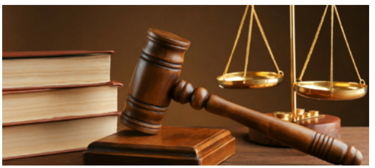
• "Election results would have had more confidence under an independent judiciary."

"These were competitive elections, better in some ways – less hate speech, less of some of the more aggressive tactics before the elections. This one respected fundamental freedoms in terms of freedom of expression, but that they too observed violations like the vote buying