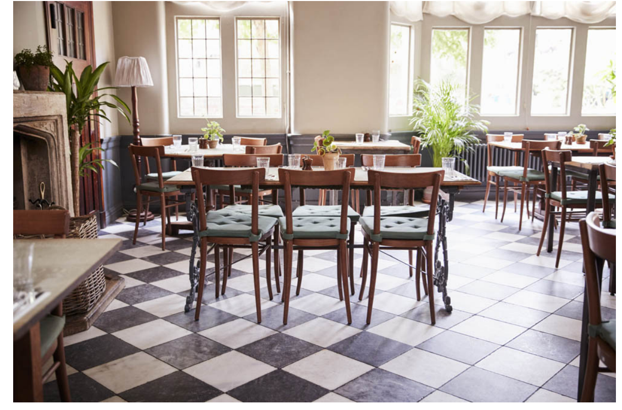
Closing the borders hit the hotels and restaurants most of the respondents.

Compared to the April survey, the trend of layoffs has decreased. In the current survey, more respondents indicated that they either do not plan to reduce staff or plan to reduce the number of staff. 75% of the surveyed companies that had their activities suspended during the quarantine period were able to resume their activities after the end of the quarantine. Closed borders remain a major constraint for the 51% of companies that have failed to resume operations.