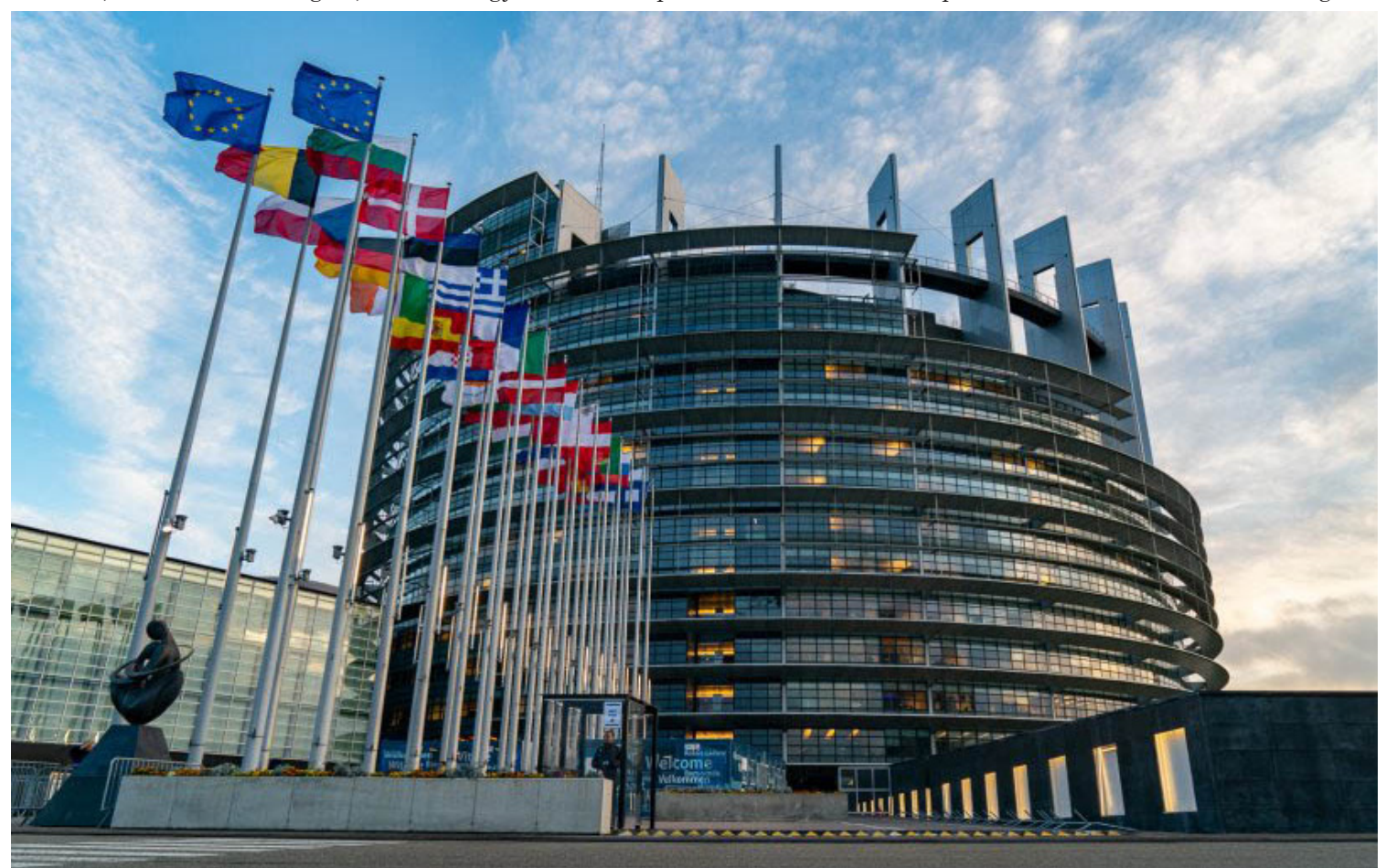
MEPs: "All the political forces represented in the newly elected Parliament must work now in a constructive fashion, keeping in mind the greater interest of Georgia's chosen European path."

The co-rapporteurs of the Parliamentary Assembly of the Council of Europe for the monitoring of Georgia also called