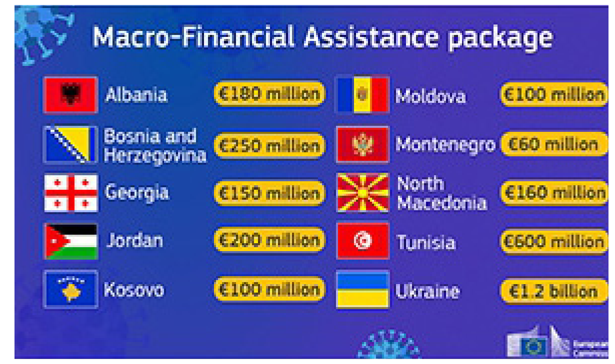
▶ This disbursement was part of a wider € 400 million EU package of disbursements to Georgia, Jordan, and Moldova.

The second part of the disbursement of €25 million comes from the MFA program agreed in April 2018, and is composed of €20 million of loans and a grant of €5 million. The policy conditions agreed and fulfilled for this