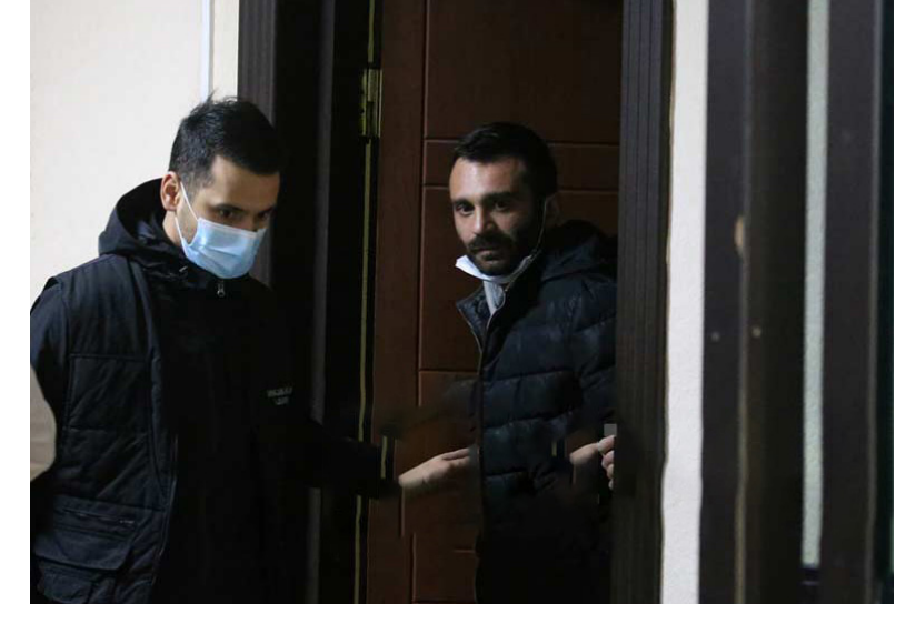
▶ The defense side plans to appeal the sentence.

The lawver asked for his client's release on ₾1,000 bail as "Zurabashvili did not intend to commit a crime and his action