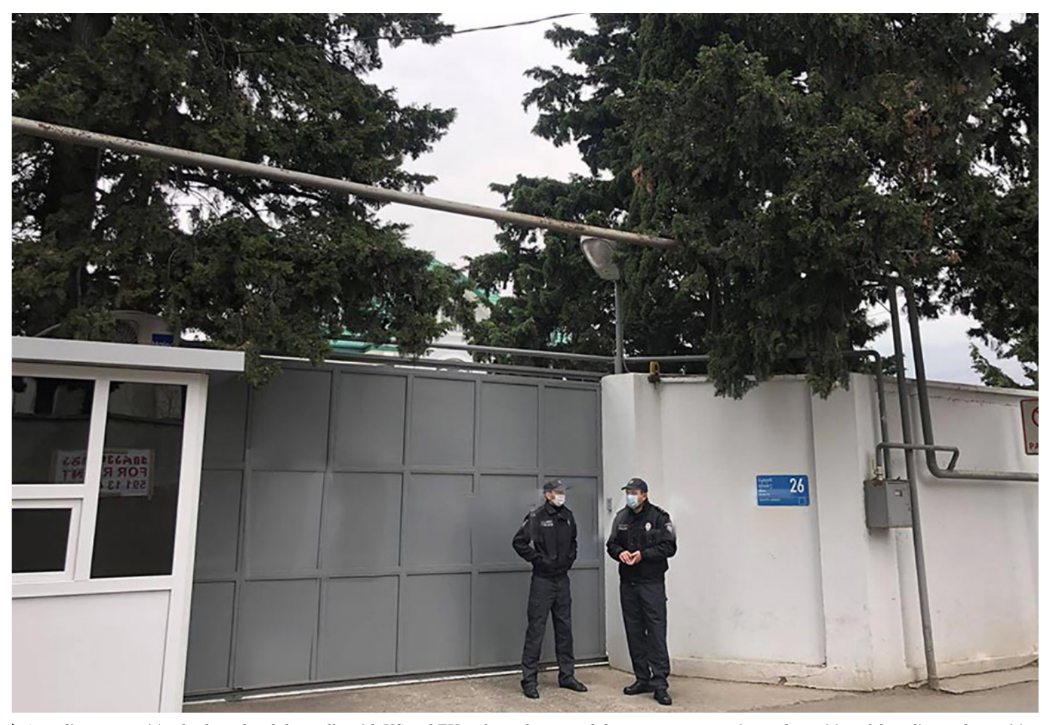
According to opposition leaders, closed-door talks with US and EU ambassadors served the purpose to approximate the position of the ruling and opposition parties for the third round of talks.