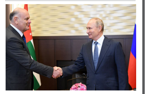
FULL STORY ON Page 2

Tbilisi condemns creation of 'common social-economic space' between Russia and occupied Abkhazia