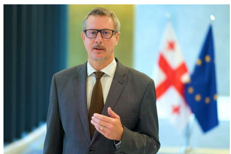
• "We are proud to allocate these funds, which will ensure the macroeconomic stability of the country so that the government can focus on providing the best support to its citizens and companies.