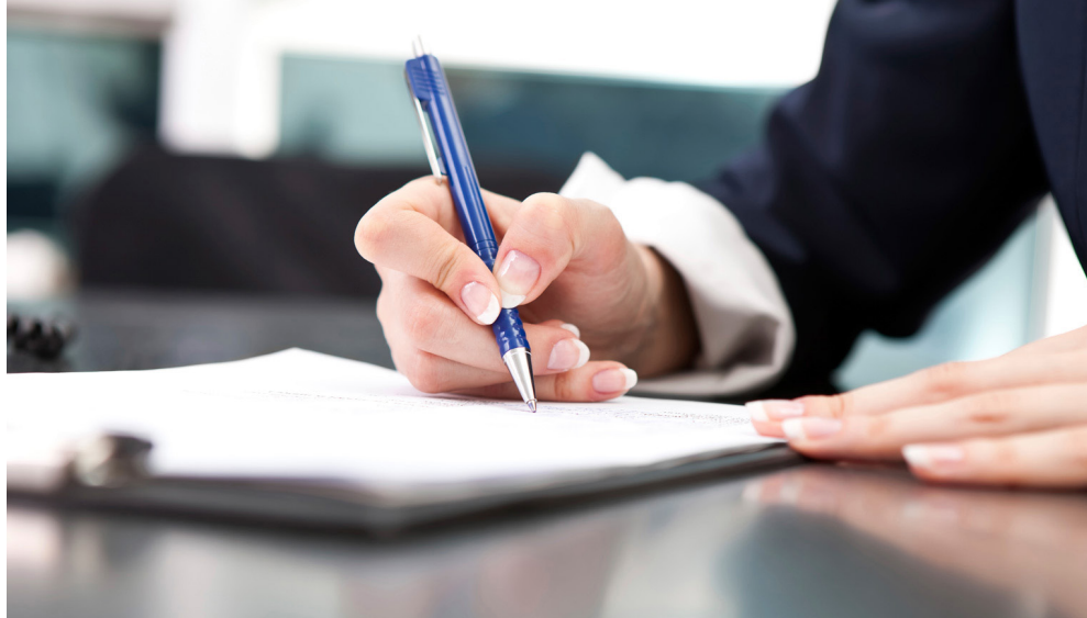
\red{\red} \begin{tabular}{l} \textbf{Opposition demands reaching an agreement with strong guarantees on holding new elections.} \end{tabular}