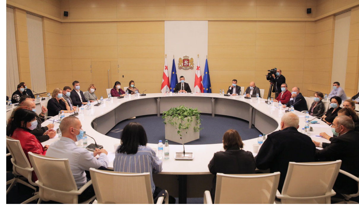
Public sector wages will increase by (b) 60 million to 1.6 billion by 2021.

According to the third submission document of the 2021 budget, a total of \bigcirc 1,420 million is envisaged to finance the measures envisaged by the anticrisis plan, including \bigcirc 280 million in 2020 and \bigcirc 1,140 mil-