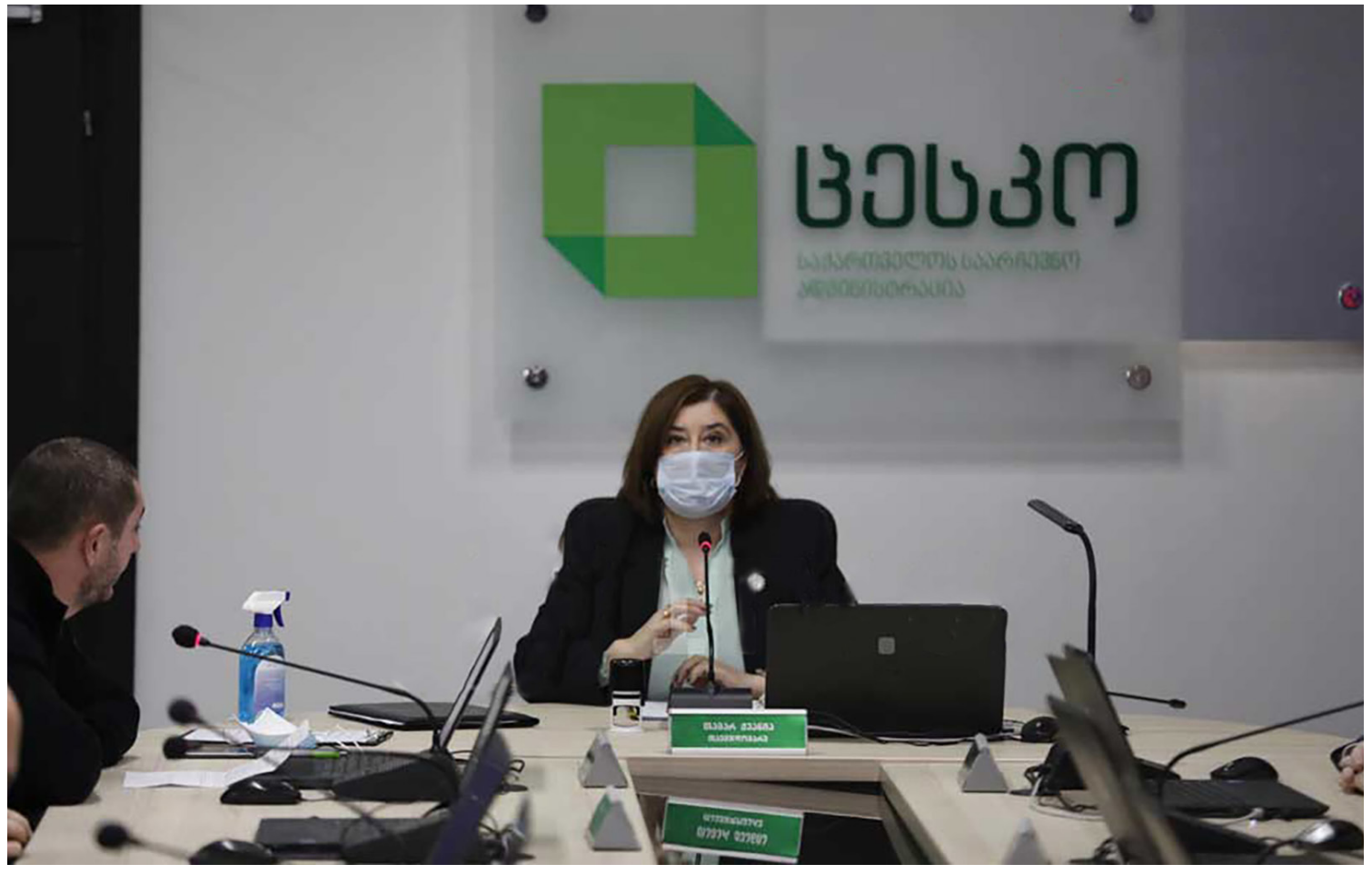
> "Political desire should not break the independent election administration" Zhvania announced.