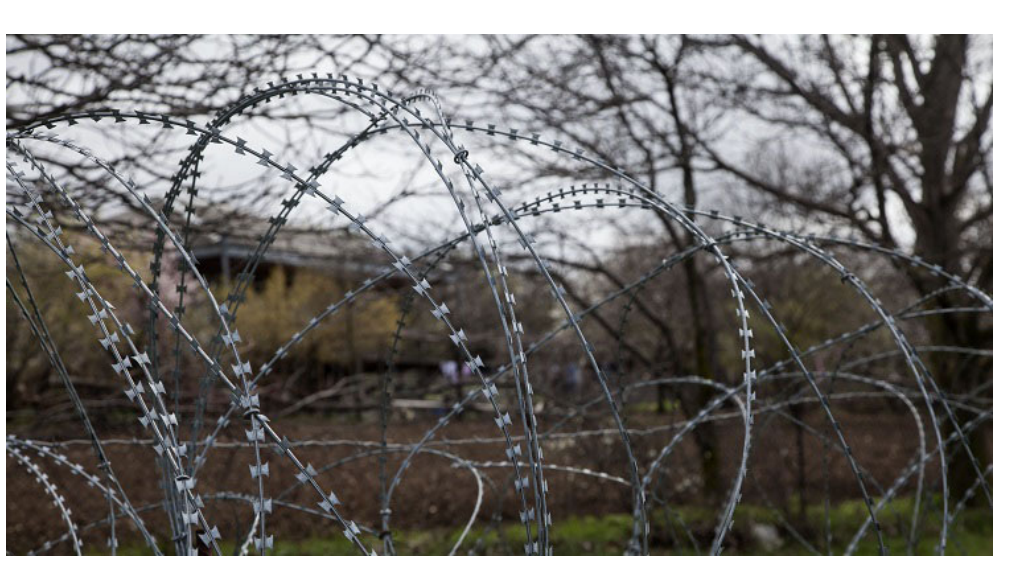
According to the locals, no one has seen how the Russian military built new constructions as they mainly worked at night.

the Georgian Foreign Ministry, Over the past two weeks, the so-called illegal borderisation took place near the villages of Tseronisi and Knolevi of Kareli municipality, as well as at the villages of Takhtrisdziri, Dvani, Koda, Tchvrinisi, and Atotsi. Near the village of Pakhulani and Muzhava of Tsalenjikha municipality of western Georgia. Near the villages of Khurcha and Ganmukhiri near occupied Abkhazia.