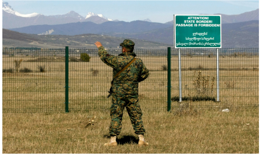
According to the MFA, over the past two months, Russia has been particularly active in its creeping annexation of more Georgian territories.