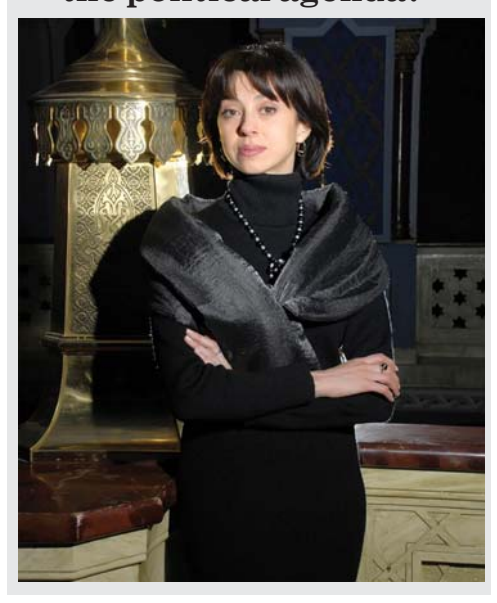
FULL STORY ON Page 2

Ballet, politicians, and national consciousness: Should art be free from the political agenda?