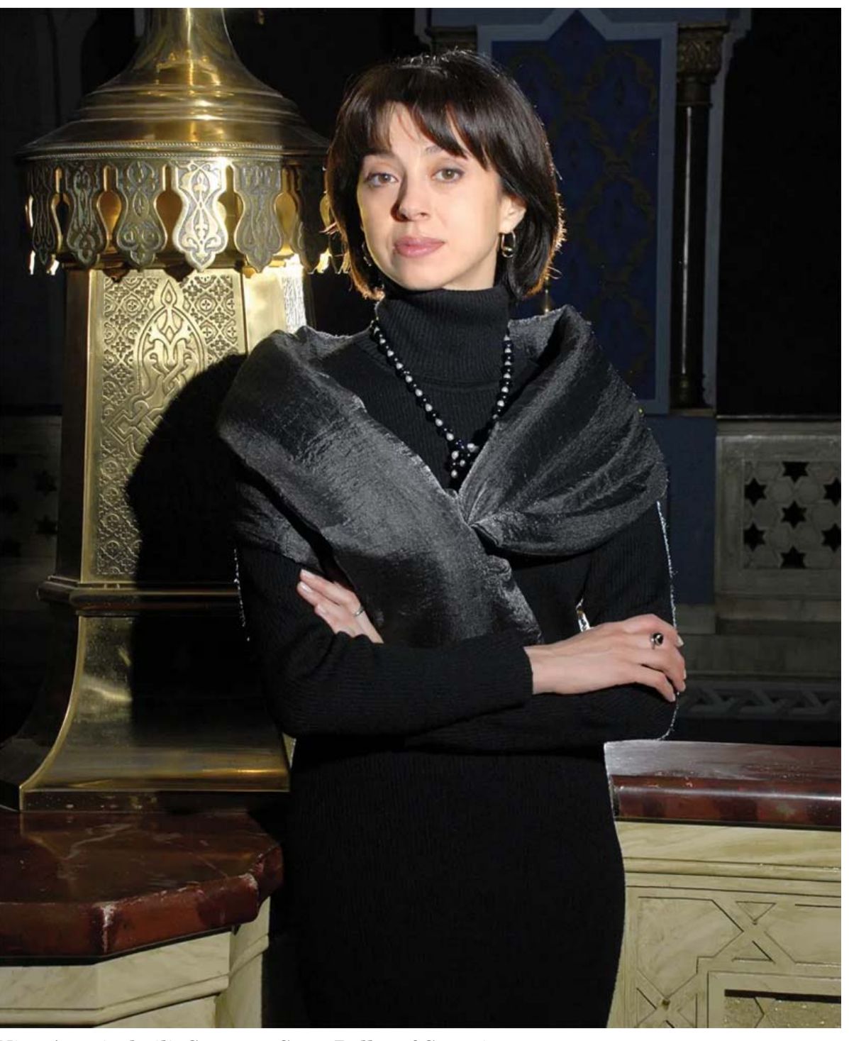
Nina Ananiashvili

Day Mostly Cloudy High: 13°C Night Mostly Cloudy Low: 6°C