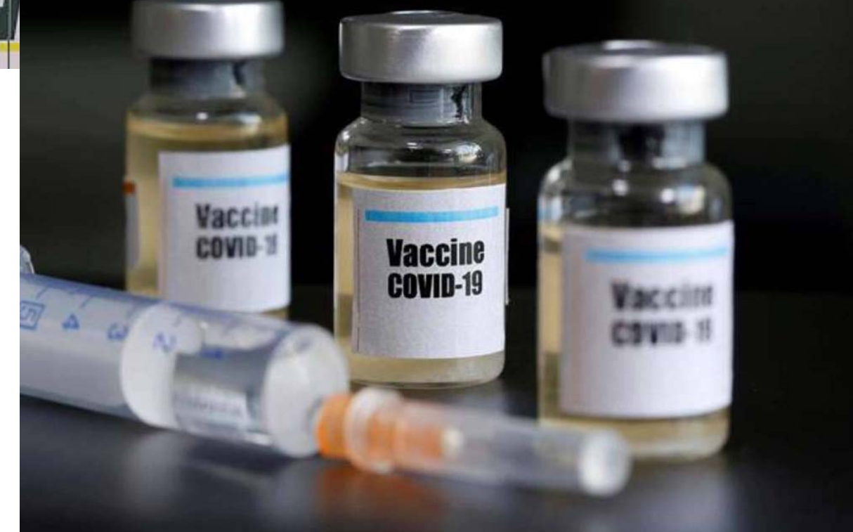
At this stage, Georgia is considering purchasing Pfizer, Moderna, or AstraZeneca coronavirus vaccines.

that the restrictions imposed by the government have been effective in stabilizing the situation, the rate of infection is still high. Thus the Inter-Agency Coordination Council has decided to extend targeted restrictions, which include suspension of municipal transport in big cities and closure of shopping malls. Restriction on movement from 21:00 till 05:00 throughout the country still remains in force. Besides the mentioned restrictions, in big cities of Georgia including Tbilisi, Batumi, Kutaisi, Rustavi, Gori, Poti, Zugdidi, and Telavi, as well as the ski resorts Open and closed markets are not