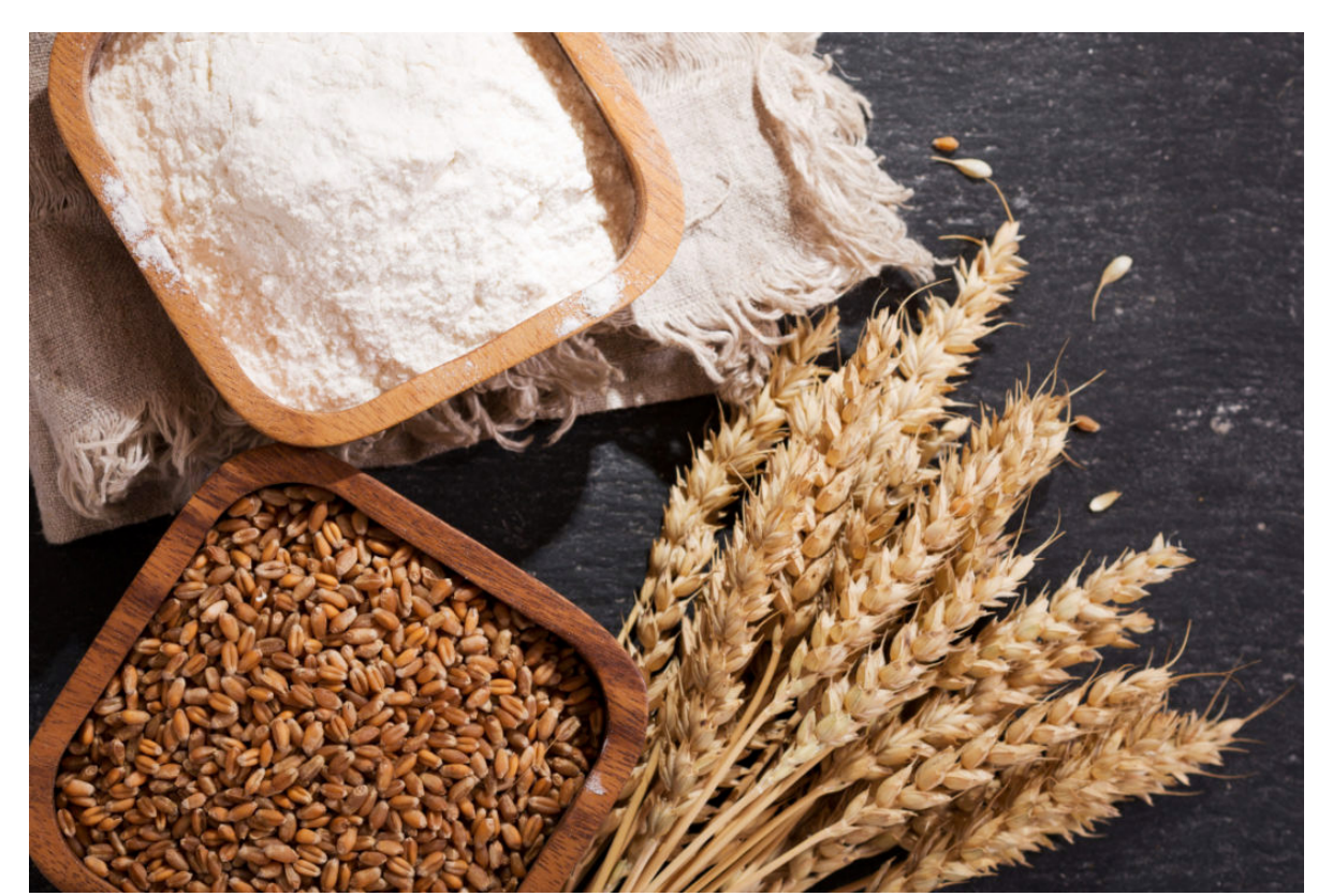
▶ There are several reasons that influence increasing wheat price in Georgia and around the world as well