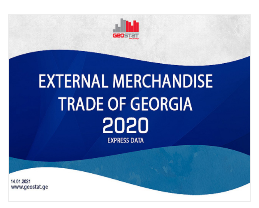
By Natalia Kochiashvili

The National Statistics Office of Georgia (Geostat) released express data yesterday on foreign trade. According to the document, due to the economic crisis created by CO-