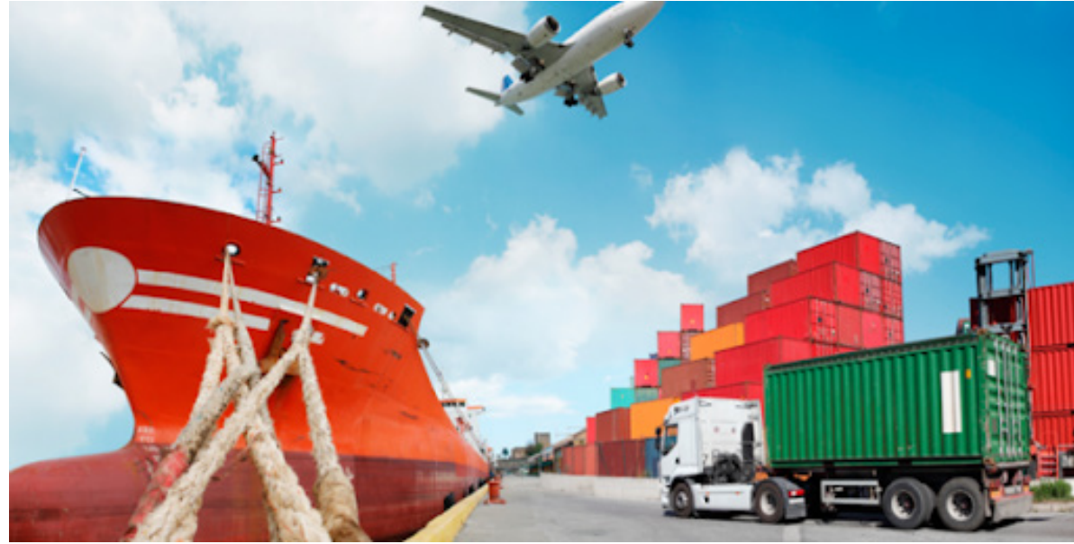
• According to express data, exports fell by 12% and imports by 15.9%.

was $ 4.66 billion in 2020 and accounted for 41.1% of foreign trade turnover," the report said.