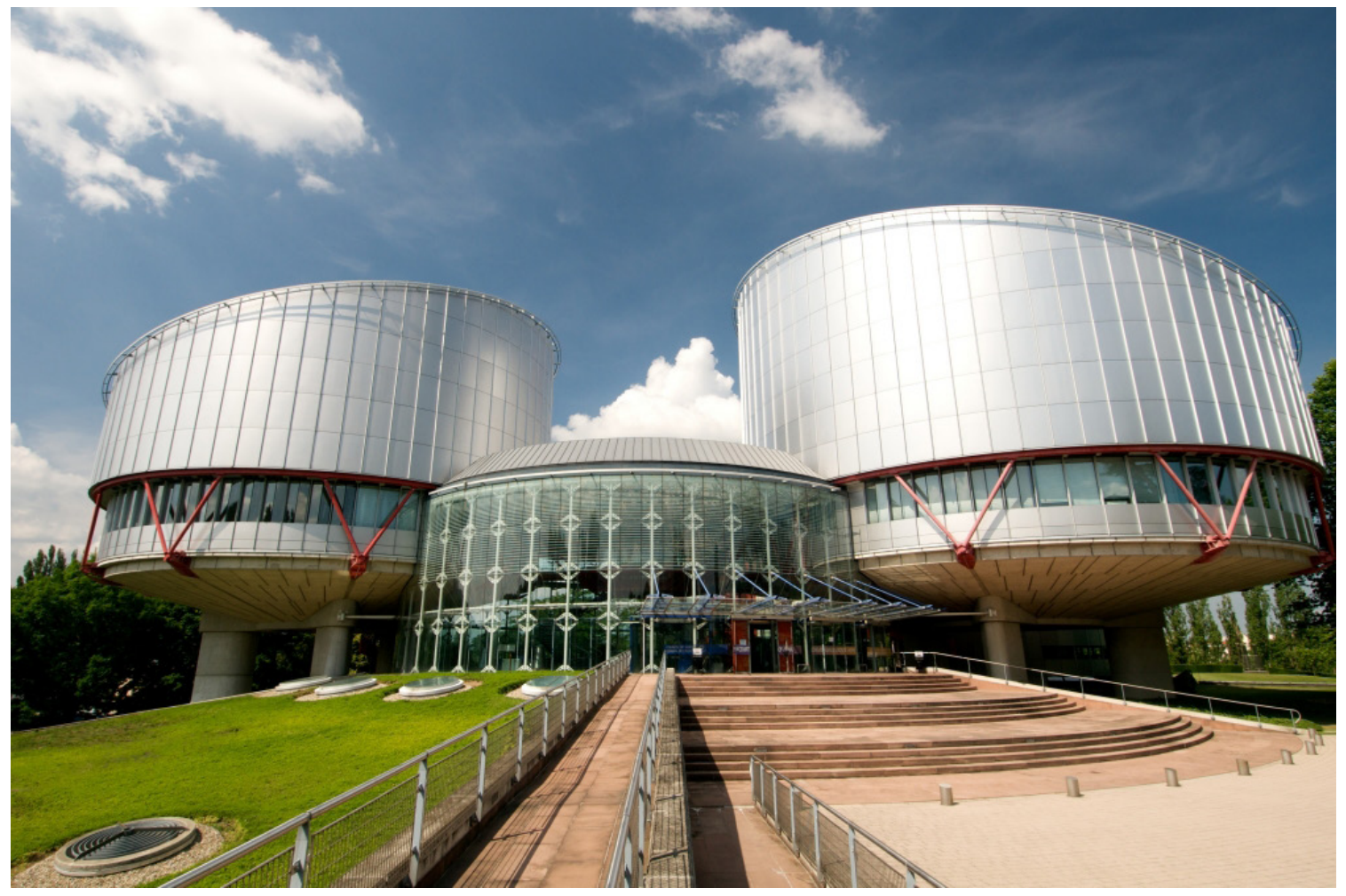
The decision of the European Court of Human Rights cannot be appealed.

or punishment (Article 3); The right to liberty and security (Article 4); The right to protection of private and family life (Article 8); Protection of property (Article 1 of Additional Protocol 1) and freedom of movement (Article 2 of Protocol No.4)