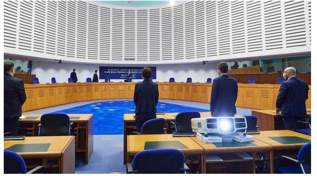
• European court satisfied all the basic requirements listed in Georgia's complaint.

Previously, Georgia has won a case against Russia in the European Court of Human Rights. It was a case involving Georgian citizens deported from Russia in 2006. The European Court of Human Rights made a ruling on this case in 2014. In January 2019 the Russian Federation was ordered to pay 10 million euros.