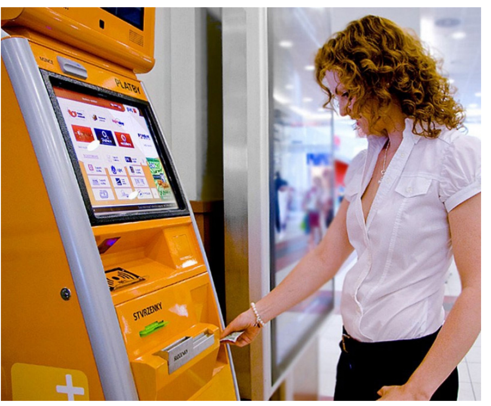
• "Entering a personal number and SMS code when transferring through self-service terminals is part of a strategy to combat money laundering and terrorist financing," the Banking Association said.

The identification/verification process is mandatory when transferring money to the following services: gambling and lottery, online games, insurance and private pension funds, financial services, including: deposit to the bank account of individuals and legal entities, services of microfinance organizations and lending entities, leasing, e-wallet replenishment, financial markets and remittances, Internet marketing, transport and logistics, tourism services, network marketing, charity, consulting services; political parties; services related to the purchase of real estate.