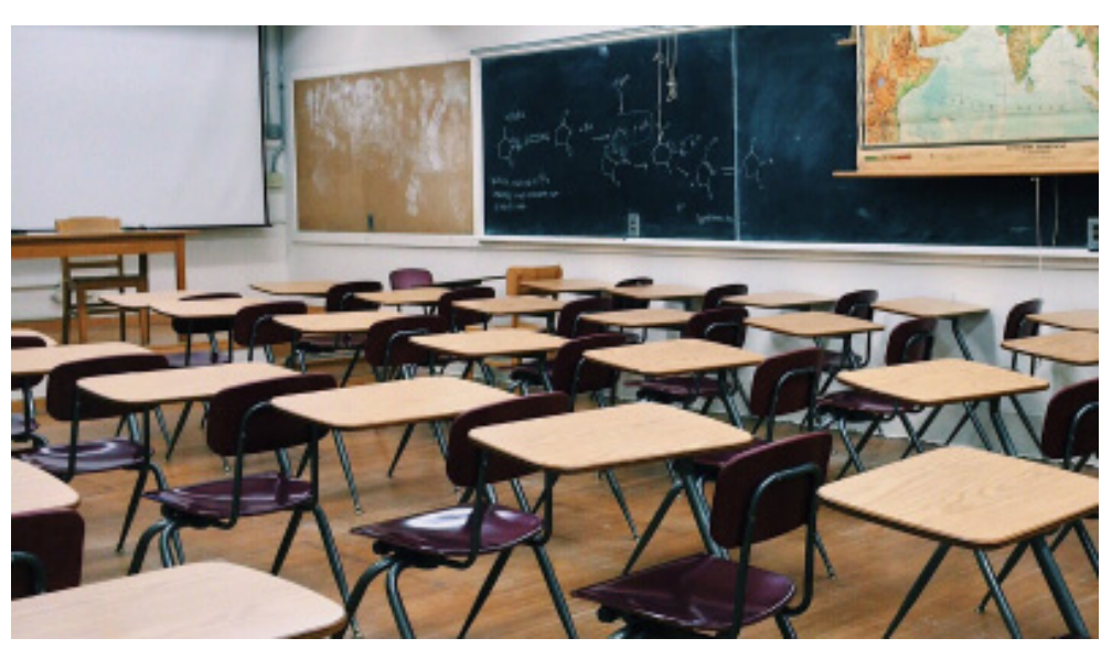
Another rally was held in Mziuri Park demanding the restoration of education processes in schools