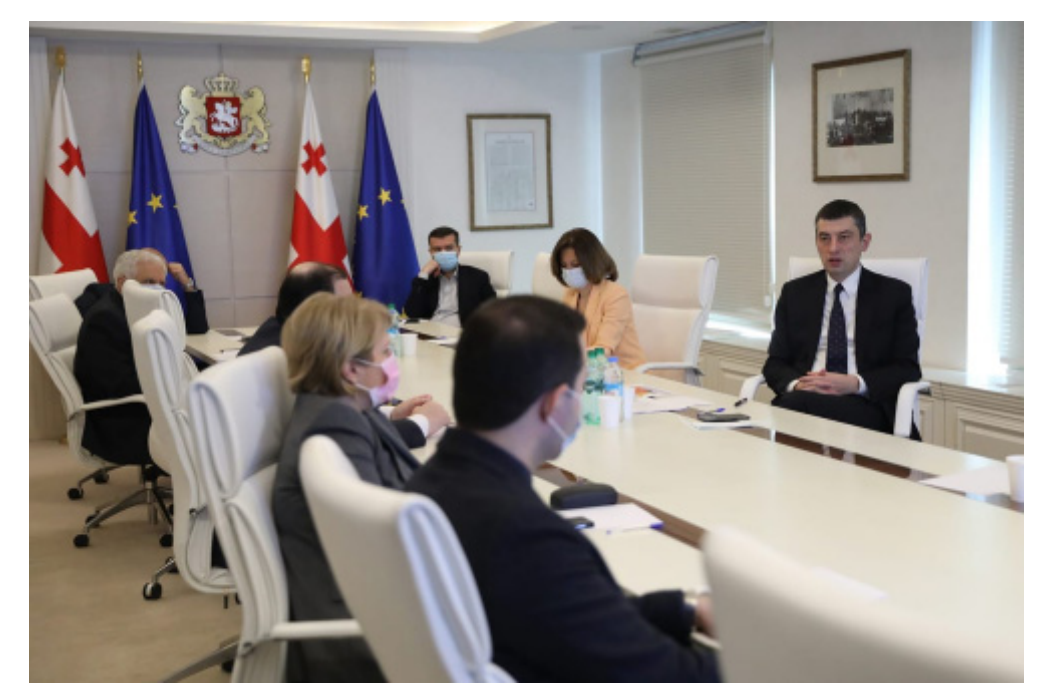
Initially, the government was planning to lift the restrictions starting in mid-January

The educational process has been going on online platforms for a year.