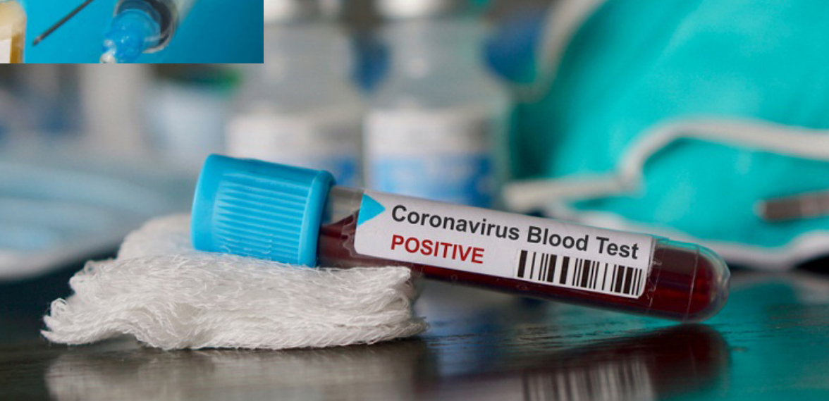
According to the plan, Georgia needs 3,979,327 doses of vaccine