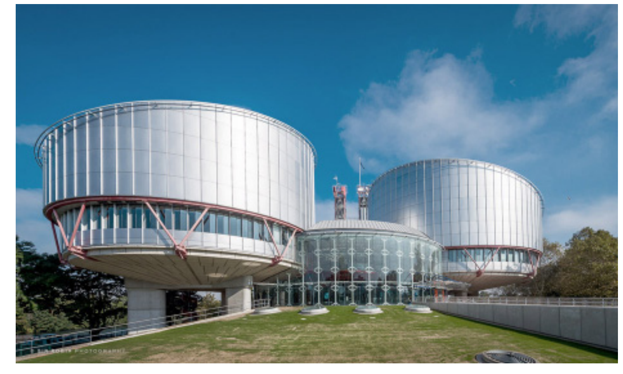
The statement is about the ECtHR's recent ruling

Achieving justice and accountability is an important part of conflict resolution and the EU calls upon the Russian Federation to ensure the