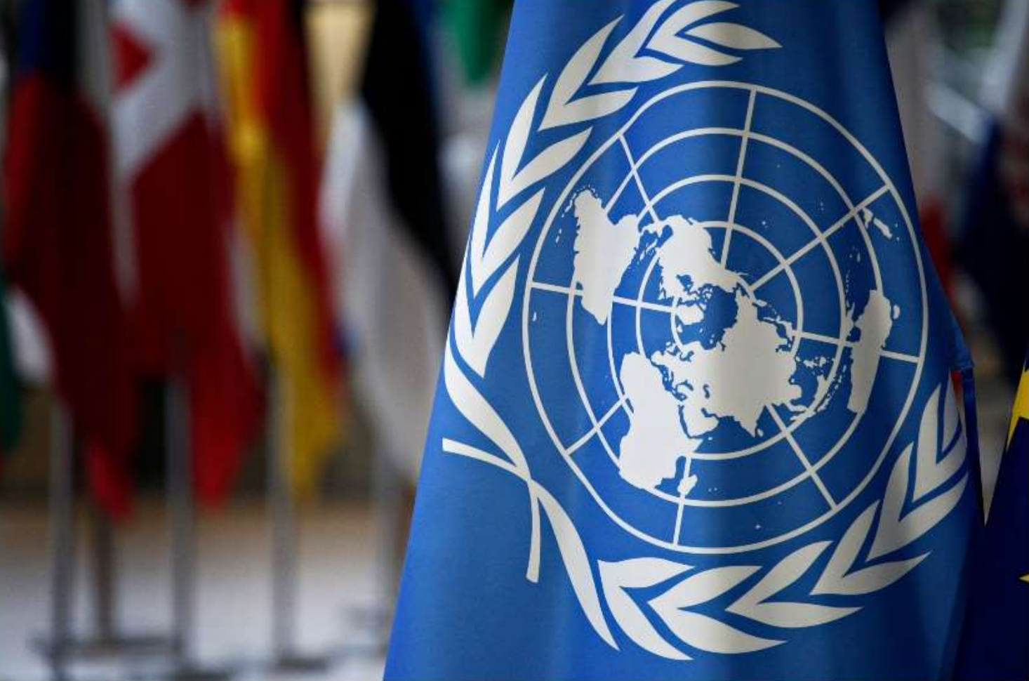
The organizations involved in the UN Universal Periodic Review Advocacy Campaign welcome the recommendations made by the Member States and call on Georgia to implement them.

challenges on topics such as discrimination, hate crimes and the rights of LGBTQ people.