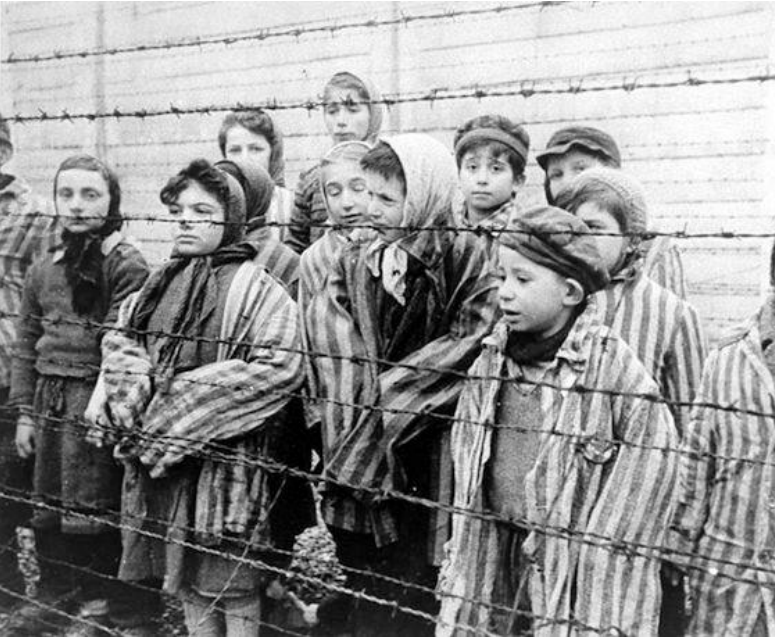
Jewish children in concentration camps.

online event, the participants talked about the possibilities of condemning each expression of anti-Semitism and recalled interesting and important facts about the coexistence of the Georgian and Jewish people. They also talked about the importance of tolerance, measures to eliminate anti-Semitic attitudes, and the benefits of the coexistence of different people in the world. The event was also attended by representatives of academia, local and international organizations, students, and other stakeholders.