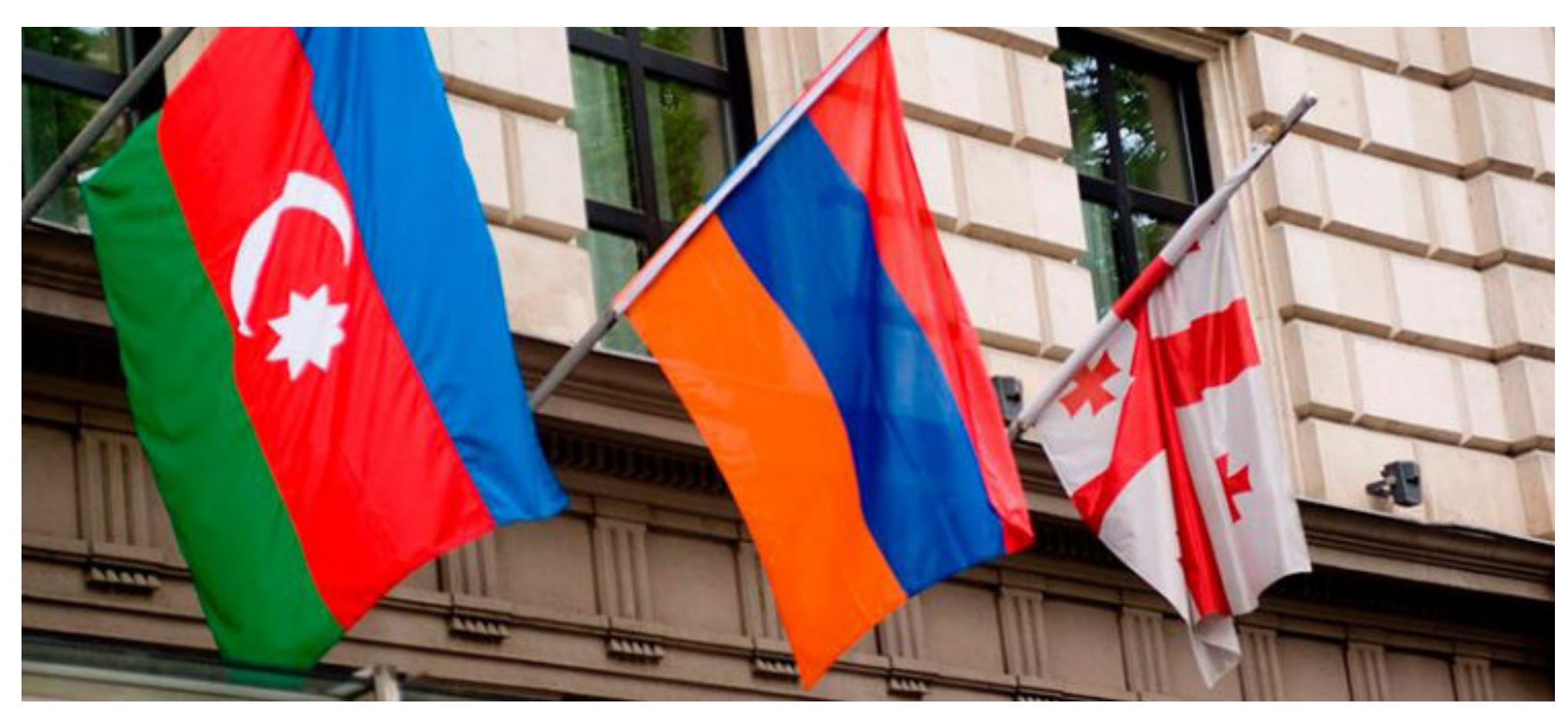
▶ Khvtisiashvili remarked on Georgia's support for those long-term purposes, which are aimed at guaranteeing the security and prosperity of Georgia and the whole region.