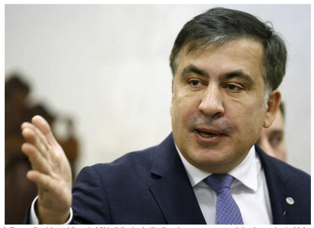
Former President of Georgia Mikheil Saakashvili offers the government to ask for the vaccine in Malta in a video address

The national vaccination plan was presented on January 21 by the Deputy Minister of Health Tamar Gabunia. According to the plan, by the end of 2021, 60% of the population should be vaccinated with the coronavirus vaccine. By 2022, 1.7 million people in the country will be vaccinated as stated in the gov-