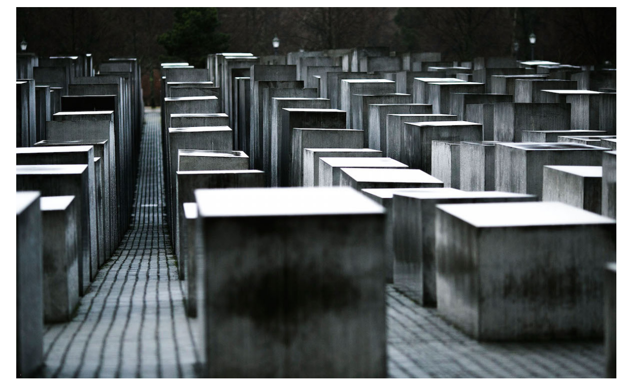
International Holocaust Remembrance Day - an international memorial day commemorating the end of the tragedy of the Holocaust that was occurring during the Second World War.