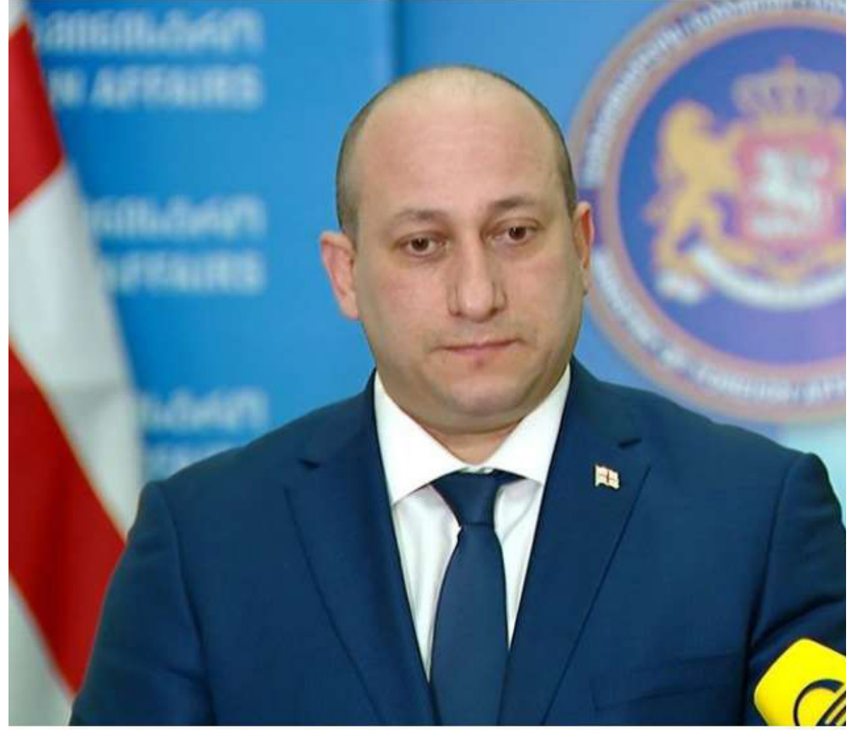
▶ Deputy Minister of Foreign Affairs of Georgia Alexander Khvtisiashvili.

any platform for cooperation should be based on mutual respect, sovereignty, and territorial integrity of the participating countries, therefore, "Georgia will not be involved in the peace platform together with the country occupying its territories."