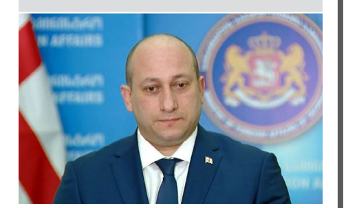
FULL STORY ON Page 2

Deputy FM responds to Sergey Lavrov's statement on Georgia participating in peace platform