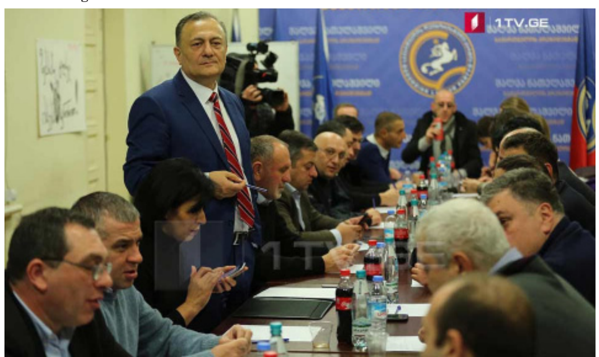
One of the opposition's demands is to call early parliamentary elections.

parliamentary parties, the Georgian Dream has already committed itself to lowering the electoral threshold for the 2024 parliamentary elections from 0 to 3% if there are enough votes (mandates). According to Mdinaradze, "all options are being considered."