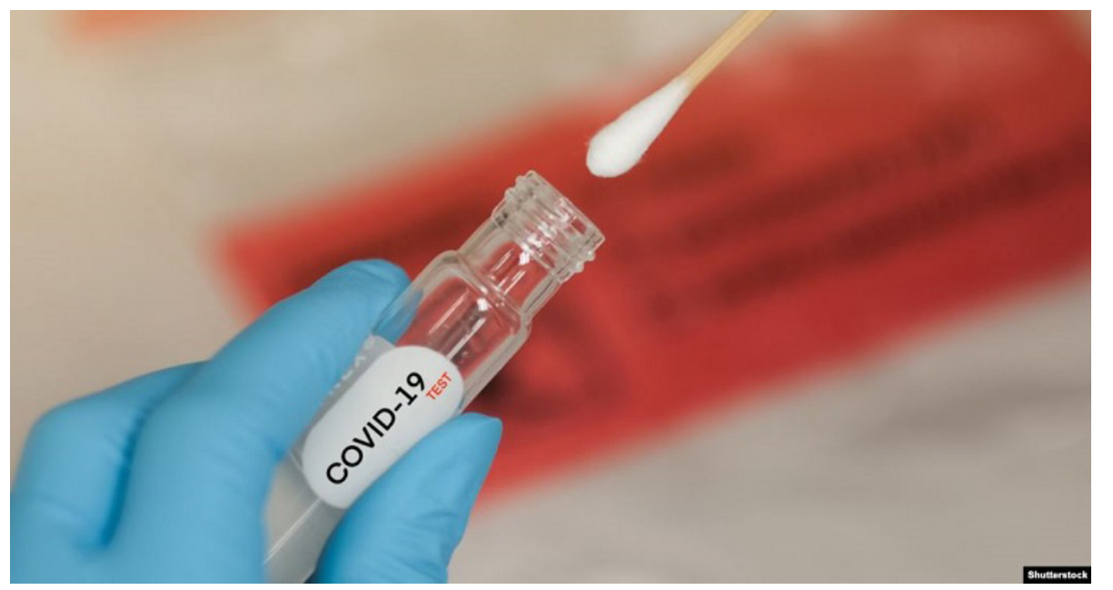
Yesterday, Georgia reported 204 new coronavirus cases, 736 recoveries, and 15 deaths.

Yesterday, Georgia reported only 204 new coronavirus cases. The daily positive test rate for the last week varies between 3,09%-3,59%.