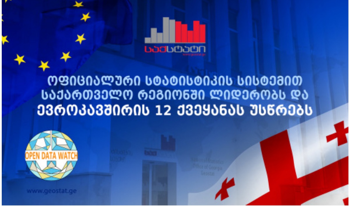
According to the report, Georgia outstrips 12 EU countries, including, (Italy, France, Belgium, Portugal, Romania, Hungary, Luxembourg, Croatia, Cyprus, Greece, Latvia, Malta

fice of Georgia has been implementing for many years. As he stated, the current leadership, along with previous representatives have greatly contributed to the success.