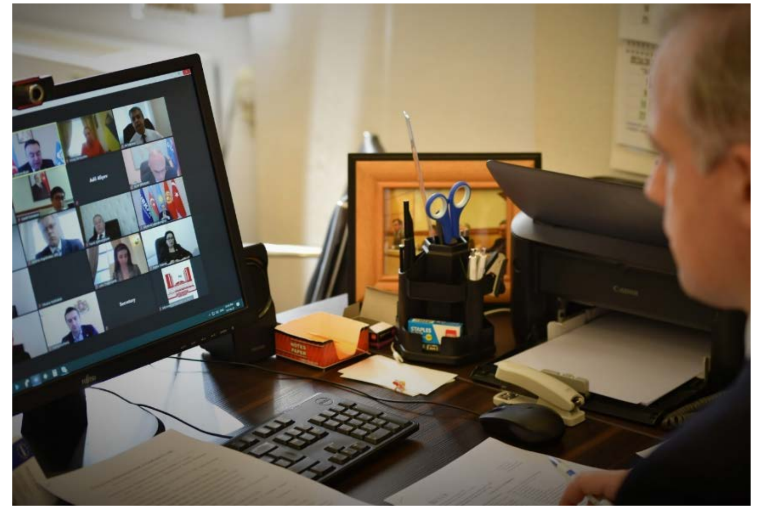
• The participants of the session of the GUAM Parliamentary Assembly discussed the deepening of future economic cooperation within the GUAM and the development of joint projects.

Georgian Parliamentary Delegation participates in 13th session of the GUAM Parliamentary Assembly