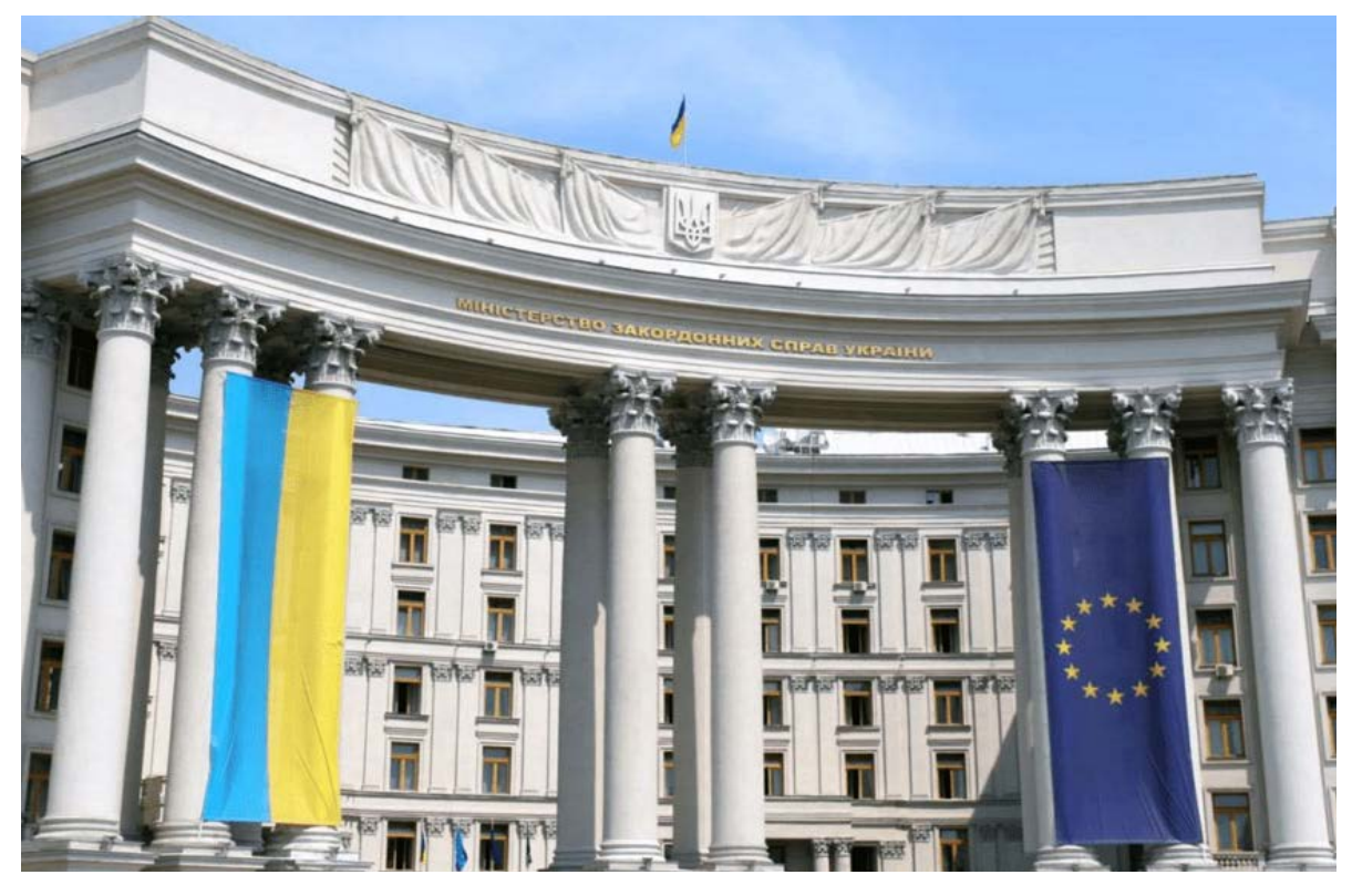
• "The allegations against the Ambassador of Ukraine to Georgia have no evidence, except for the emotions of the accuser, Ukrainian diplomacy will not try".