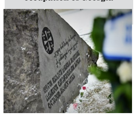
FULL STORY ON Page 2

100 years since Soviet occupation of Georgia