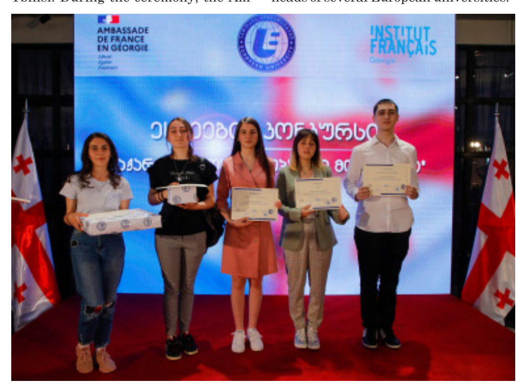
The competition was organized by the European University and the Embassy of France in Georgia