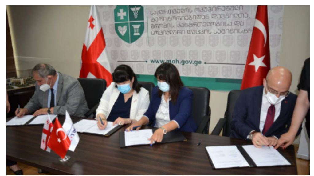
The memorandum was signed between the Ministry of Internally Displaced Persons from the Occupied Territories, Labor, Health and Social Affairs of Georgia, the Georgian Association of Transplantologists, and TIKA

Within the framework of the Memorandum of Understanding, in cooperation with the Ministry and with the support of the Turkish International Cooperation and Development Agency (TIKA), Turkish and Georgian colleagues will start working together on topics such as curriculum refinement, internships with specialist centers/clinics and other specialist organizations. Implementation of educational programs, the establishment of a national coordination system, and so