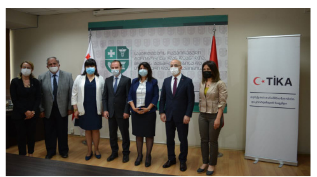
There are numerous training and workshops planned