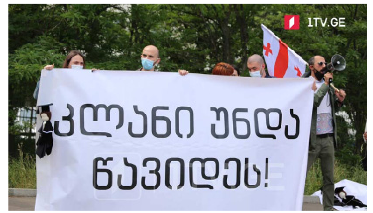
The conference of judges took place against the background of a protest demanding the postponement of the voting. "The clan must leave," reads the banner.

The newly-elected members of the council do not agree with the allegations of the protesters that they were elected only because they enjoy the protection of influential groups of judges. According to them, the balloting process was transparent.