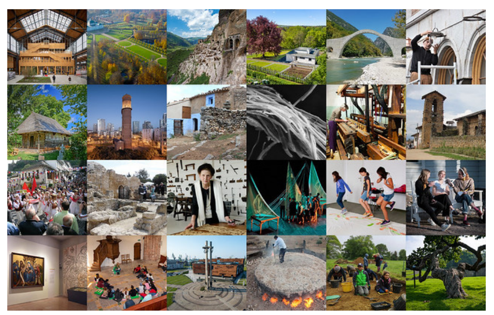
In 2021, the European Leading Award was given to 24 projects from 18 European countries in seven different nominations.

According to Europa Nostra, the successful pilot project which has formed the basis of the Rock Cut Heritage Safeguard