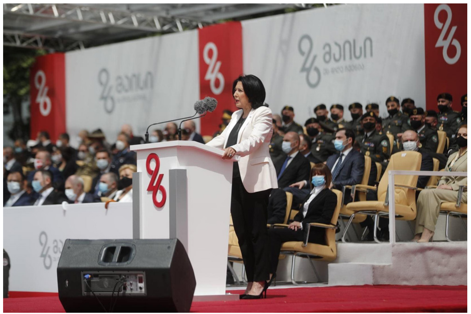
"We hope that the June 14 NATO summit will open the prospect of taking a new step on the path to integration into the Alliance," said the president in her speech.