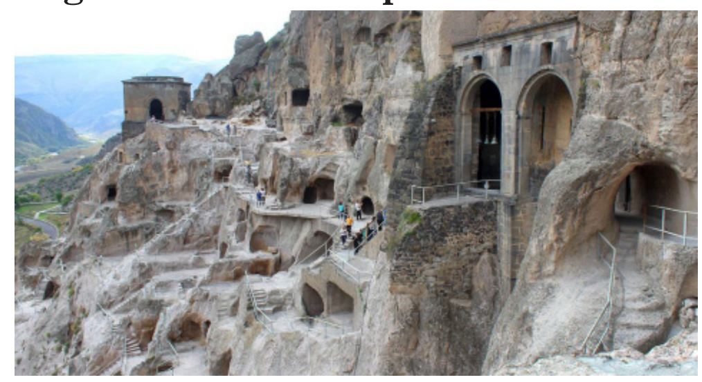
The creation of the Vardzia Rock-Cut Complex was initiated in the second half of the 12th century by King George III and was completed under the reign of his daughter, Queen Tamar.