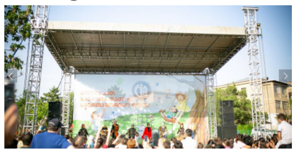
City hall organized a special event for children in Mziuri Park.