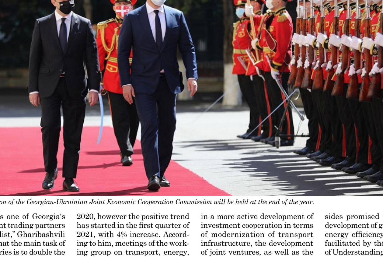
▶ The 10th session of the Georgian-Ukrainian Joint Economic Cooperation Commission will be held at the end of the year.

The sides discussed the main directions of bilateral cooperation between Georgia and Ukraine. It was noted that trade and economic relations between the two countries are expanding, and to further increase trade turnover, it is important to make full use of the potential for economic cooperation. The importance of strengthening ties in the field of tourism and transport was also stressed. Ukrainian PM stated that the relations between the peoples of Ukraine and Georgia are gaining more momentum, which is an important signal for business and citizens of the two countries.