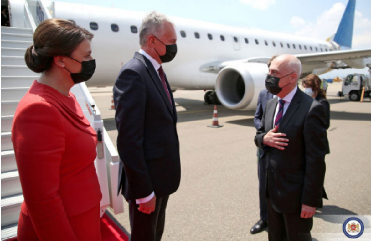
Today, President Nauseda will meet Georgian president Salome Zourabichvili

The visit started on June 10 and will last until June 12.