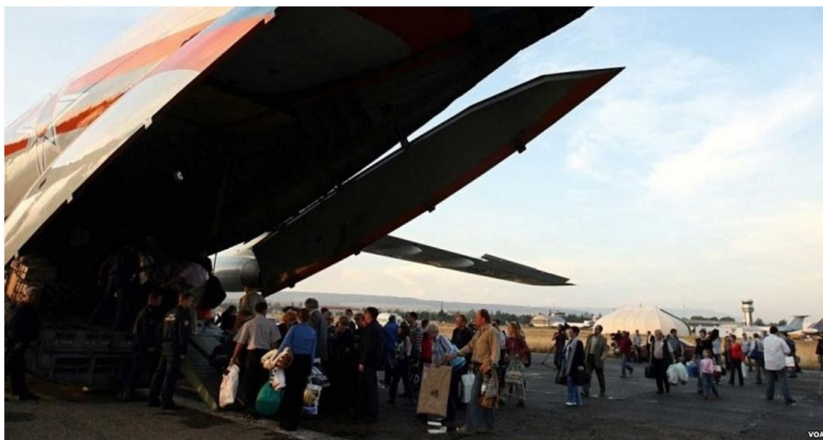
More than 2,300 were detained and forcibly expelled and the remaining left Russia by their own means

Russia has been blaming Georgia for not providing the precise list of the "victims", which "hinders the refund process." Ria Novosti reported that Russian officials are expecting Georgia to provide the list of those affected by the expulsion, including the exact type of violation they faced and the amount of the compensation per person.