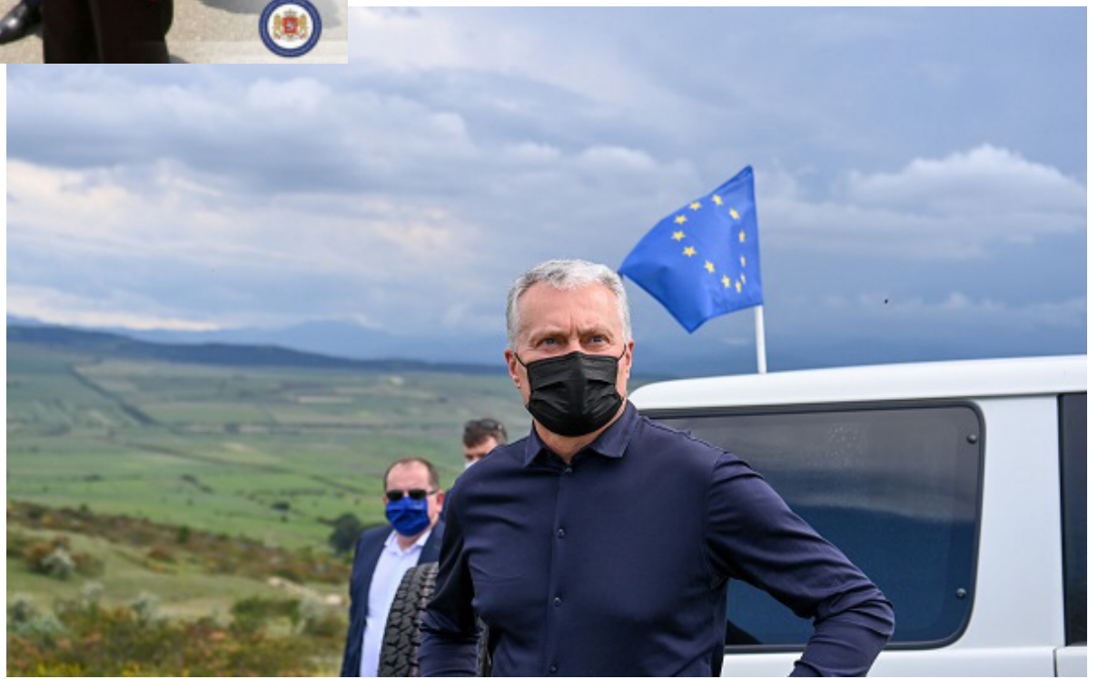
Lithuanian president visited occupation line near the village of Khurvaleti

Today, the President of Lithuania, Gitanas Nauseda, will meet Georgian President Salome Zourabichvili. In addition, the President of the Republic of Lithuania will also meet with the Prime Minister of Georgia Irakli Gharibashvili and the Speaker of the Parliament Kakhaber Kuchava.