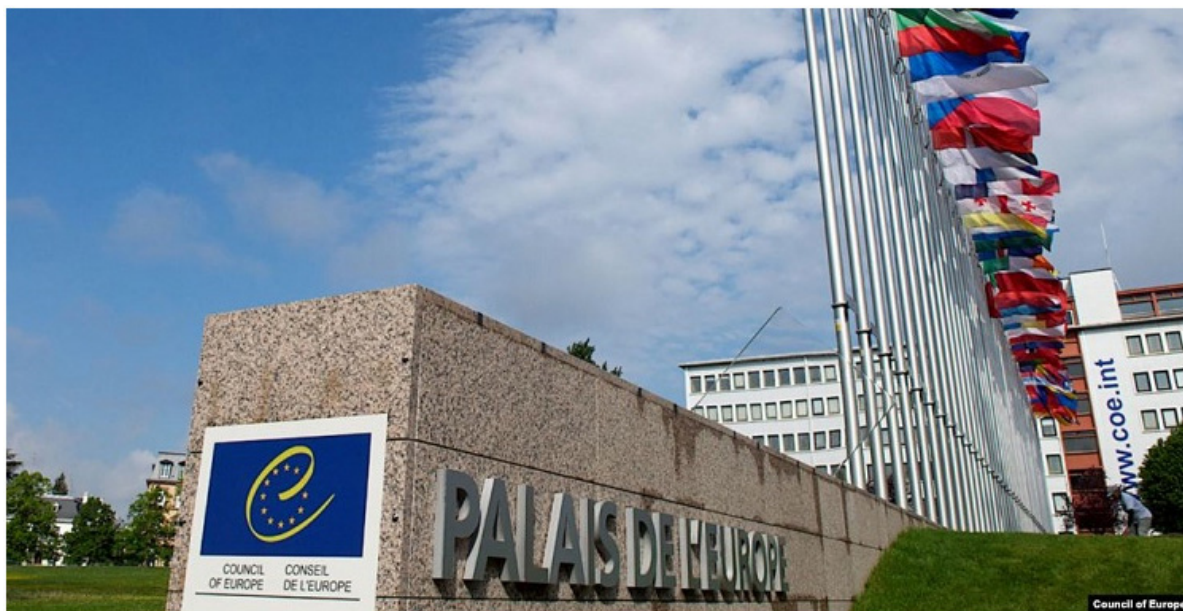
The ECHR judgment concerns the arrest, detention and collective expulsion of Georgian nationals from Russia in the autumn of 2006.