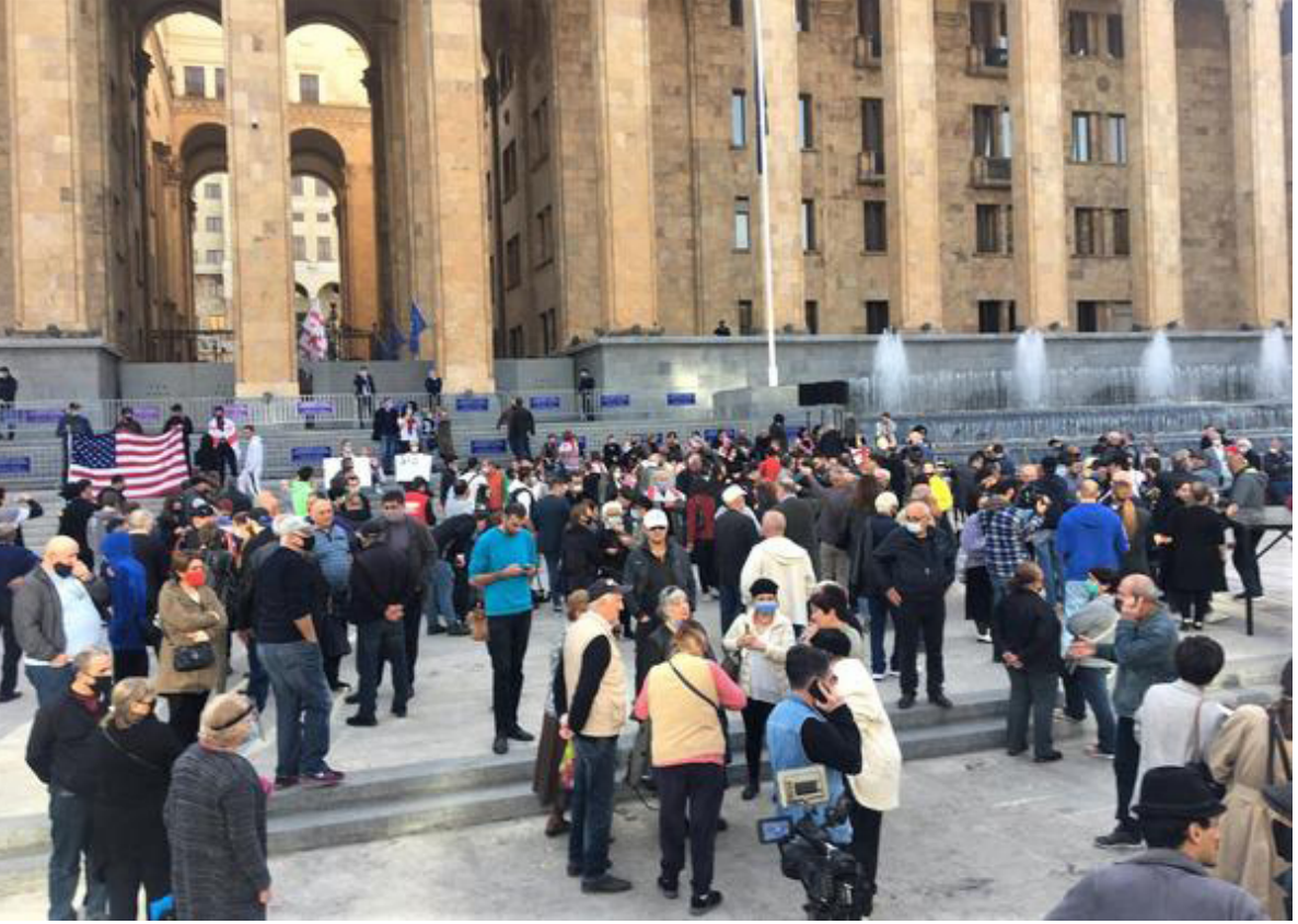
Another rally was held in front of Parliament organized by civil society

The scandal around the Ninotsminda boarding schools erupted after the representatives