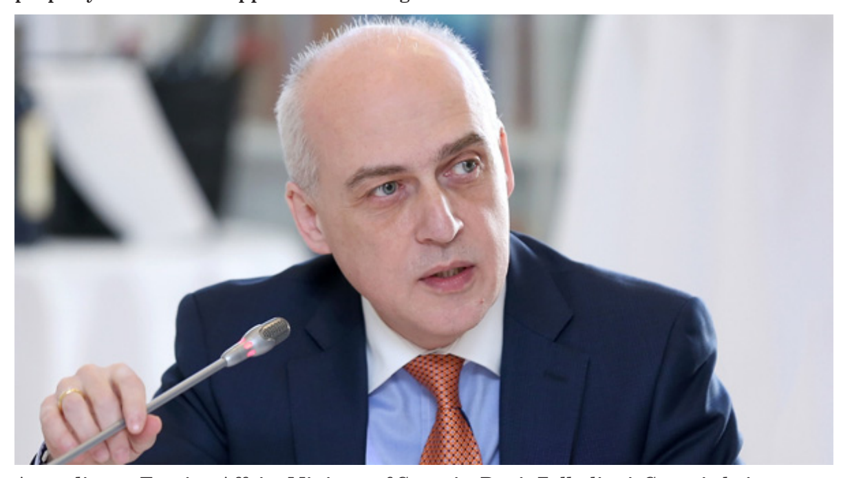
According to Foreign Affairs Minister of Georgia, Davit Zalkaliani, Georgia being on the agenda of the summit is very important