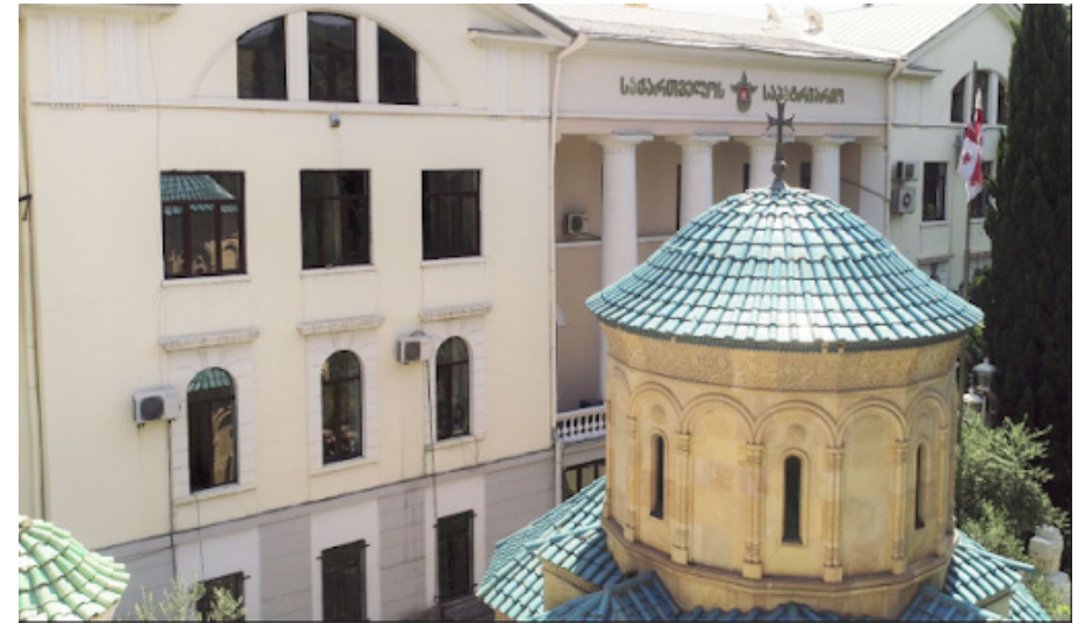
A special meeting at Patriarchate of Georgia was attended by Health Ministry representatives, as well as members of Holy Synod and international partners of Georgia