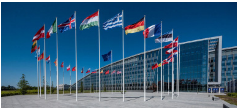
Brussels Forum was held in parallel with the NATO summit on June 14.

Strengthening Georgia's democratic institutions, boosting economic development, and pursuing modernization are some of the important endeavors that we pursue to be more resilient in the face of the external threats," PM of Georgia Giorgi Garibashvili stated.