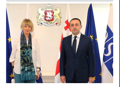
FULL STORY ON Page 2

OSCE Secretary General meets Georgian leaders