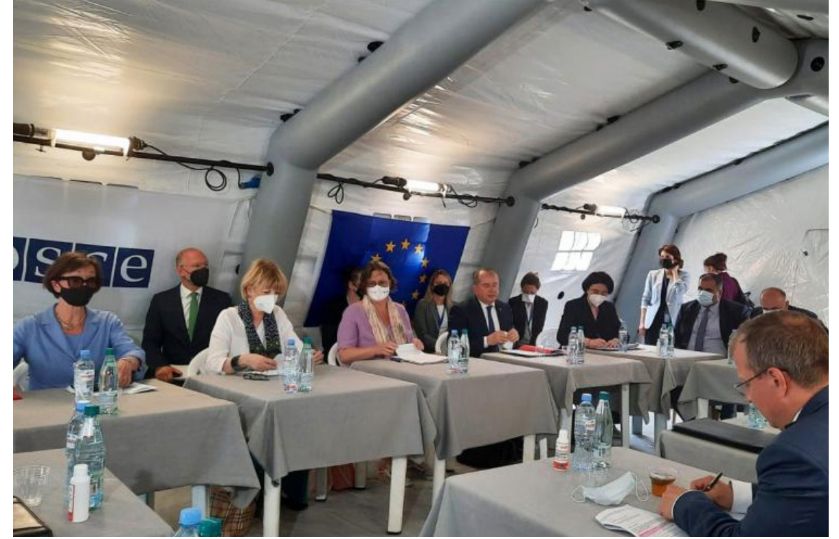
▶ Secretary General Schmid participated in 100th Incident Prevention and Response Mechanism in Ergneti.

The secretary General stressed the need to continue engaging with all stakeholders: "It is a special moment for me to be here today, having been closely involved in setting up this mechanism. It remains crucial for defusing tensions and solving concrete security and humanitarian issues, and also to alleviate the burden of the conflict-affected people."