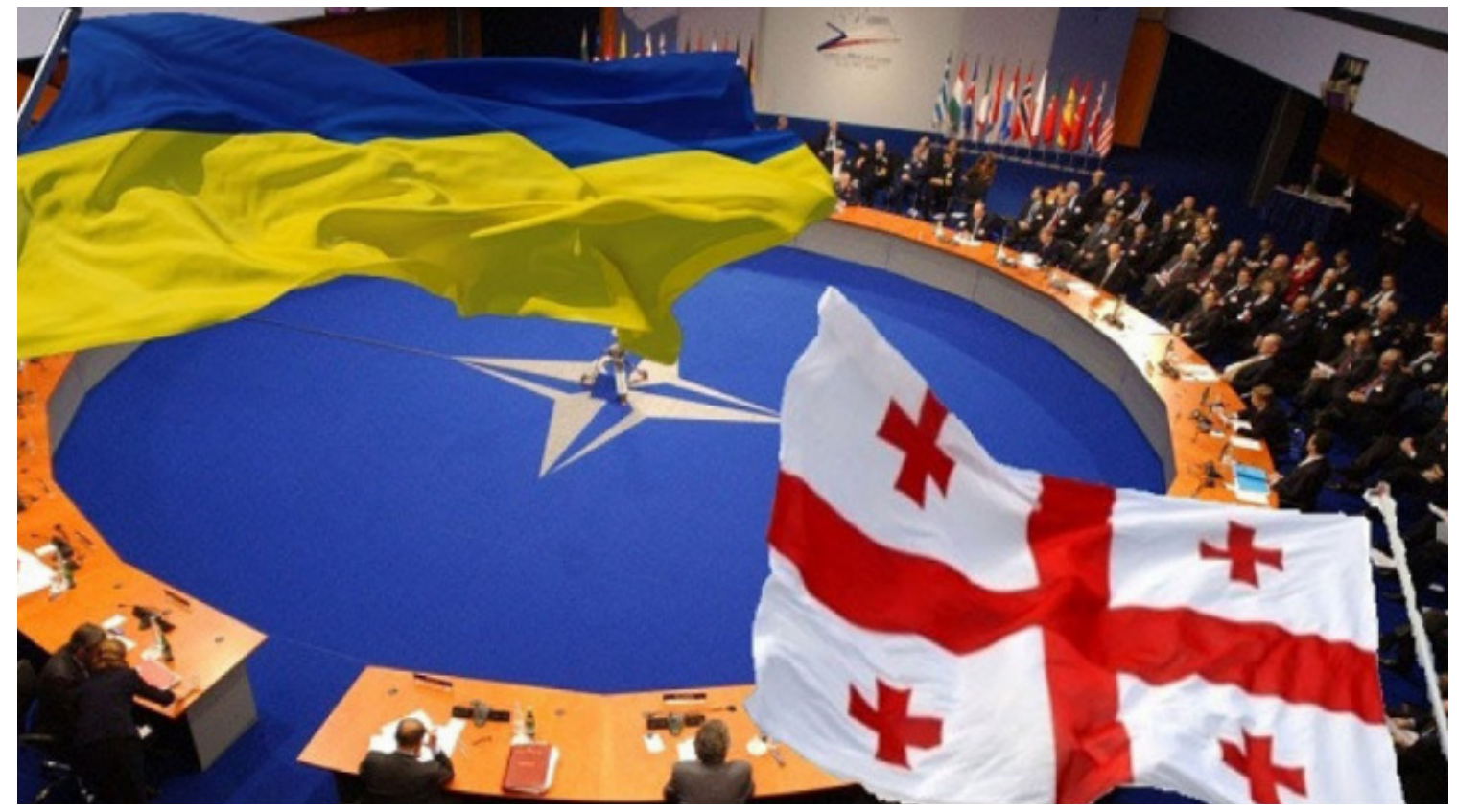
"Russia's first play to subvert democracy in Eastern Europe started with the Republic of Georgia," says US Senator Jeanne Shaheen.