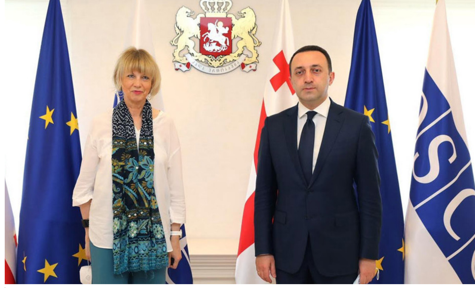
Ahead of meeting with Georgian authorities OSCE Secretary General travelled the village of Tsitsagiaantkari near the Russian-controlled Tskhinvali region.

The President of Georgia Salome Zurabishvili met with the OSCE SecGen at the Orbeliani Palace. They agreed to hold a conference of women leaders in Georgia (the role of women in peace and security). The parties discussed the forthcoming local elections and stressed the importance of the participation of election observation missions, especially the OSCE/ODIHR observation mission.