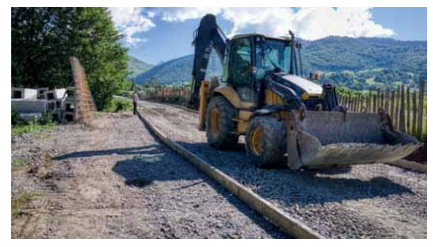
BLOG BY TONY HANMER

e are all used to our fixed travel surfaces being static while we move. This is normal in most situations, earthquakes being a major exception. Rivers and airways aren't static, so that counts them out. But our roads and paths just lie there for our pleasure. Except when they are first being built, or reno-