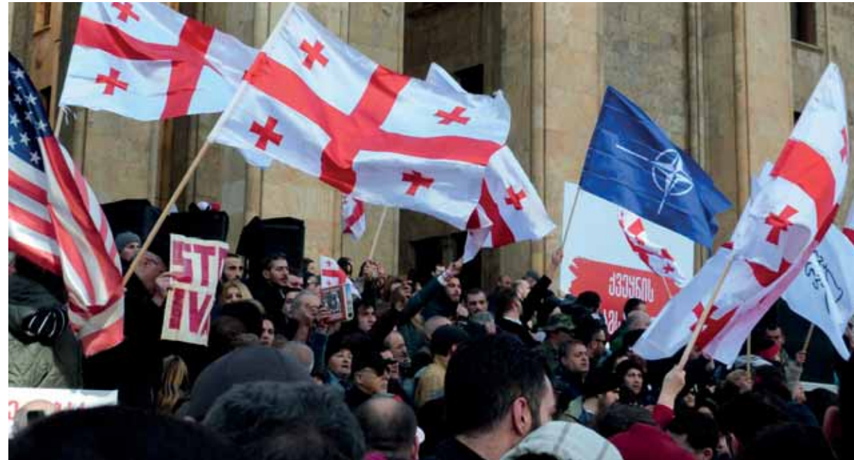
Protesters waving flags in front of Georgian Parliament.

Our western dream will never come true unless we the people undertake our fair share of action before it is too late