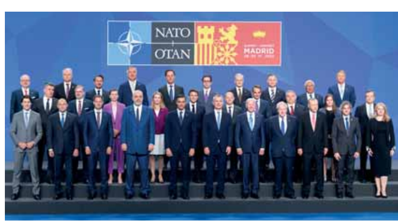
NATO Madrid Summit 2022.

These are systems that should have been delivered long time ago. Incrementalism has defined the West's support to Ukraine. Our economic sanctions have been incremental; our security assistance has been incremental. This stuff should have been flowing, these actions should have been taken when the Russians were marching their forces against Ukraine back in March, April, May of last year. Every so often, we add another economic sanction, but Russia is still sucking in billions of dollars every week from the sale of its commodities abroad. The EU alone has spent some $90 billion on Russian oil and gas since the war started. That's not cutting off an economy, that's financ-