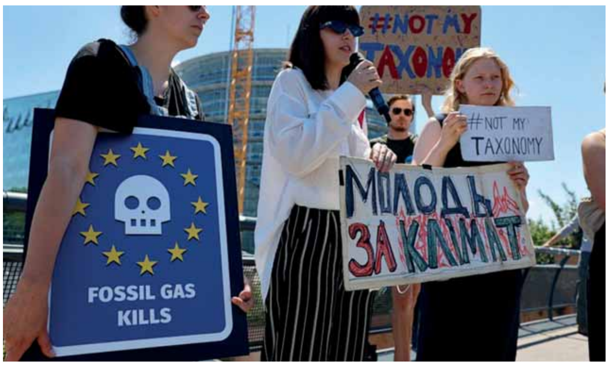
Climate activists demonstrate outside the European Parliament.

With the EU aiming to reach climate neutrality by 2050 and to cut greenhouse gas emissions by at least 55% by 2030, the commission says the classification system is crucial to direct investments into sustainable energy. It estimates that about 350 billion euros of investment per year will be needed to meet the 2030 targets.