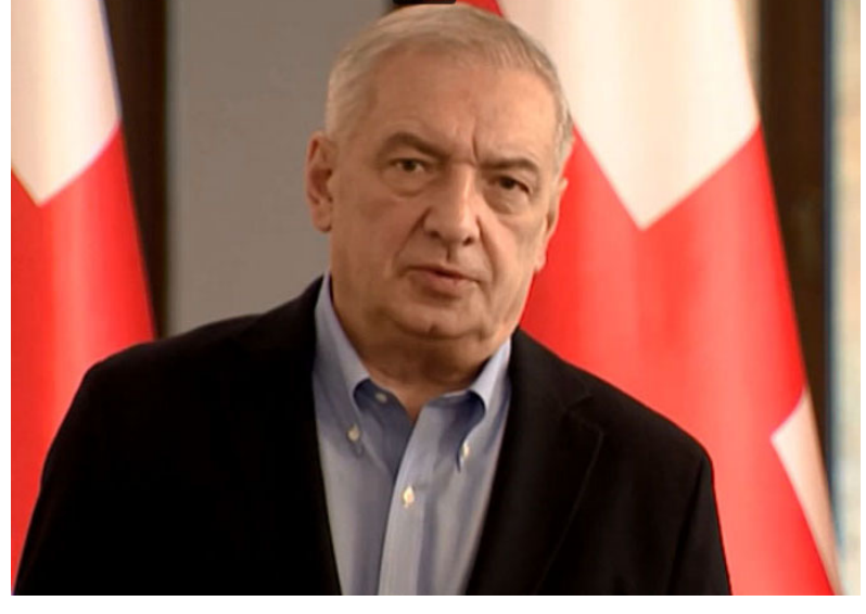
The first vice-speaker of the ing elections. He stated that